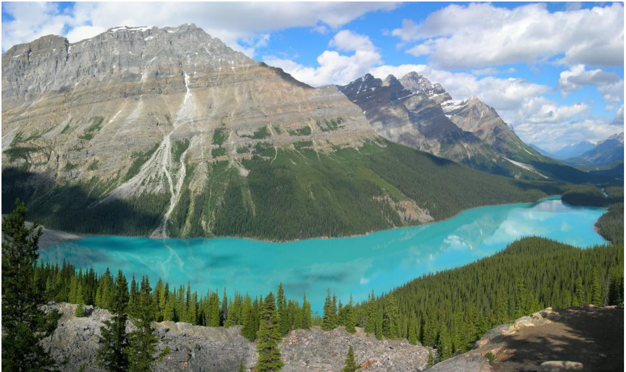
Peyto Lake, one of the attractions located in Banff National Park

maintaining inviolable a place for people, the contradiction at the heart of the national park idea.