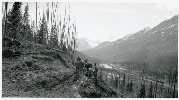
Road building in Banff, 1925