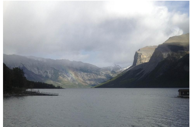
Lake Minnewanka, Banff National Park, Alberta, 2012

This work is licensed under a Creative Commons Attribution 2.0 Generic License .