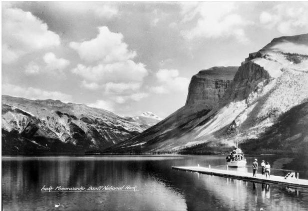
Lake Minnewanka, Banff National Park, Alberta, ca. 1900-1925