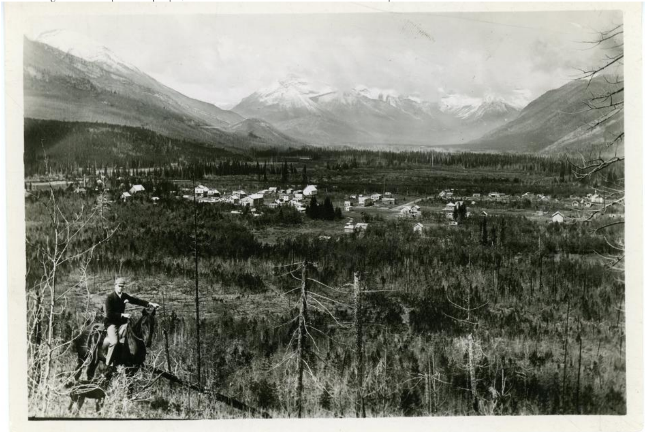
Banff town site, 1889 or 1890

Banff was Canada's first national park, created in 1885, and has always been its most visited and most famous. Banff National Park has been active in terms of development but in recent decades it has also become active in maintaining ecological integrity. The spotlight of attention that Banff receives ensures it will continue to be a site of intense human use and intense protection. Banff exemplifies the contradictions inherent in maintaining inviolable a place for people, the contradiction at the heart of the national park idea.