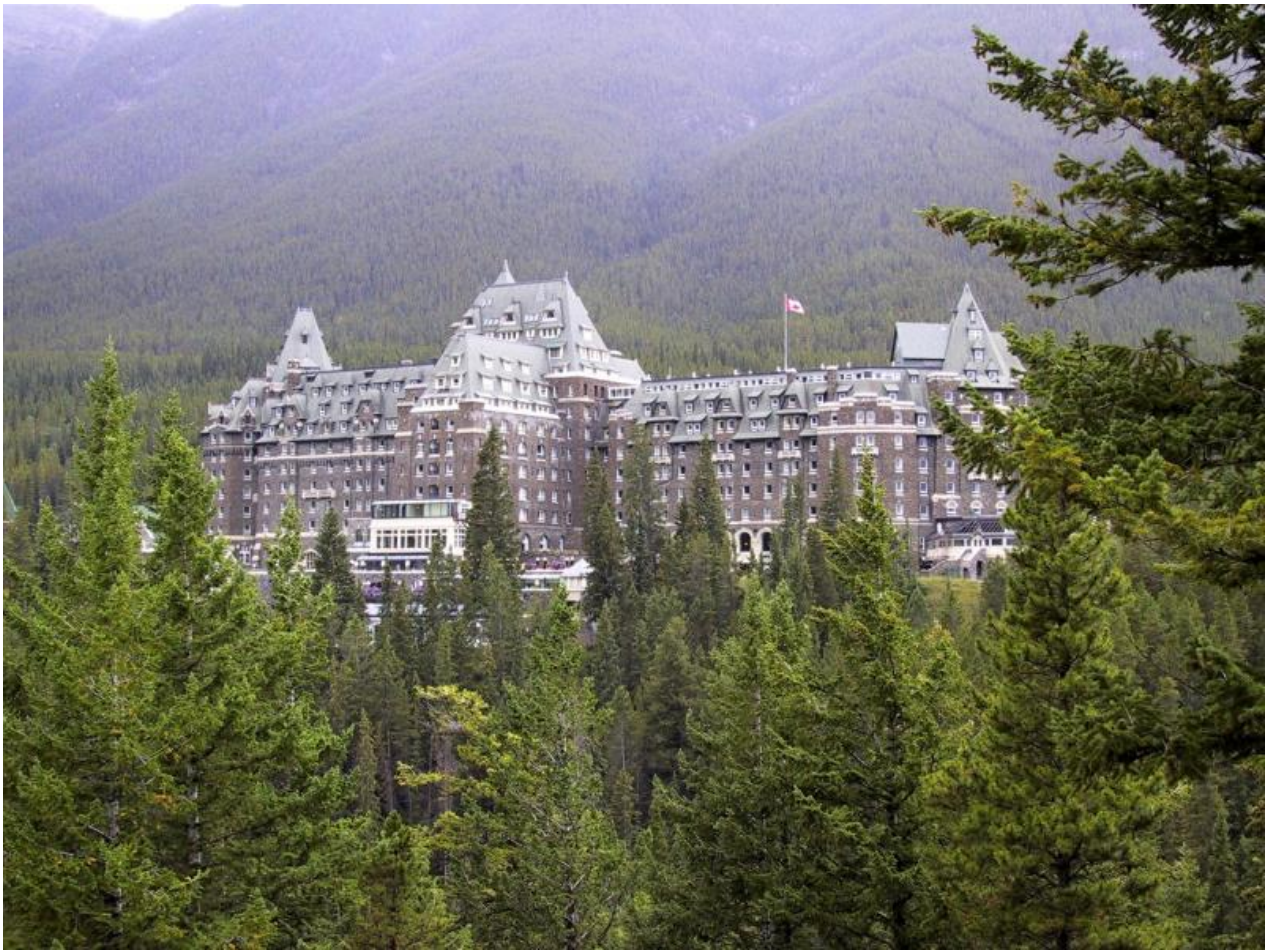
The Banff Springs Hotel today