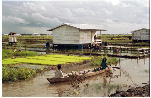
Canals and early rice paddy, prior to fires, Mega Rice Project site, 1997