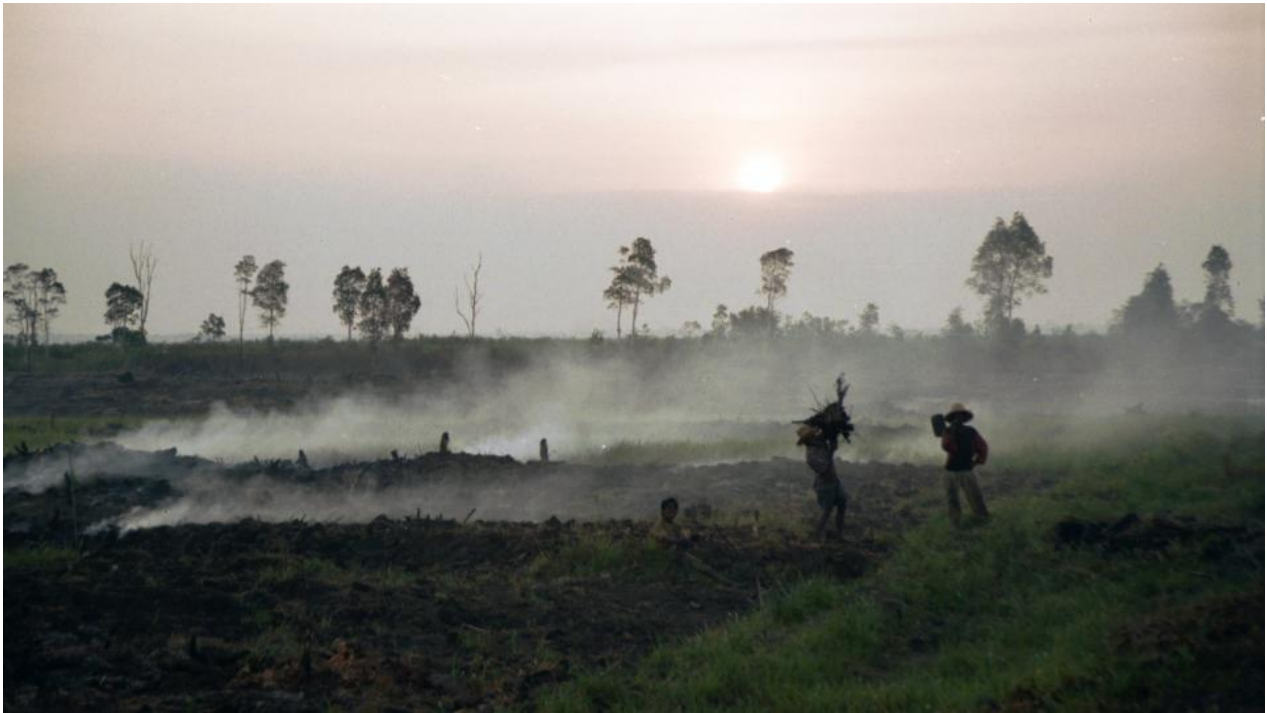
Smoldering peat soil in rice paddy, Central Kalimantan, late 1997

concentrated in peat soil and is relatively stable if the soil is saturated with water. But when tropical peatlands are drained across a large hydrological area, as they were in the Mega Rice Project, the soil undergoes rapid biogeochemical oxidation, emitting vast amounts of carbon dioxide into the atmosphere.