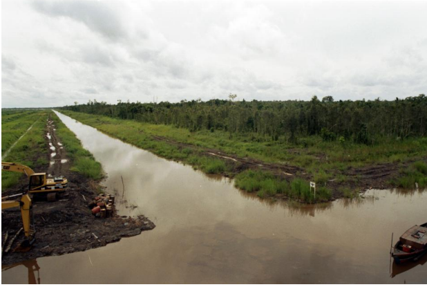
View of canals excavated in peat forest for Mega Rice Project, Central Kalimantan, 1997