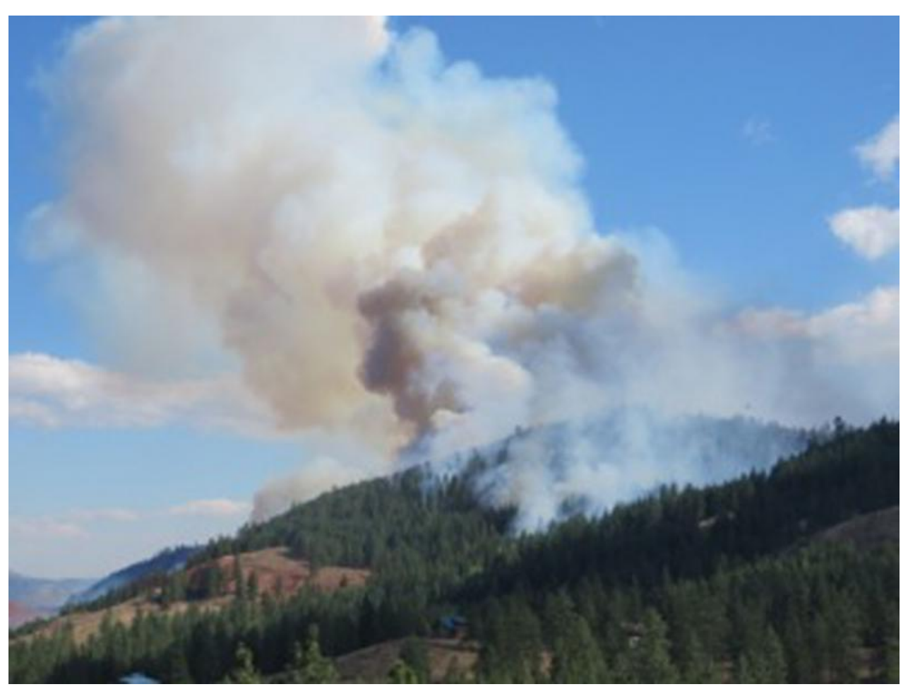
Fire near Winthrop, WA

This work is licensed under a Creative Commons Attribution-NonCommercial-ShareAlike 4.0 International License.