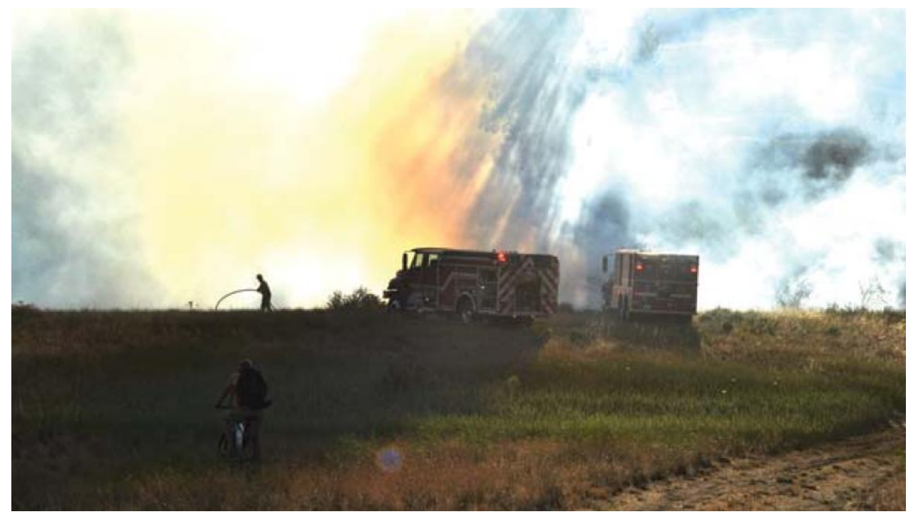
Fire on East Chewuch property near Winthrop, WA, July 2015

© Photo by Ann McCreary. All rights reserved. Click here to view Methow Valley News source.