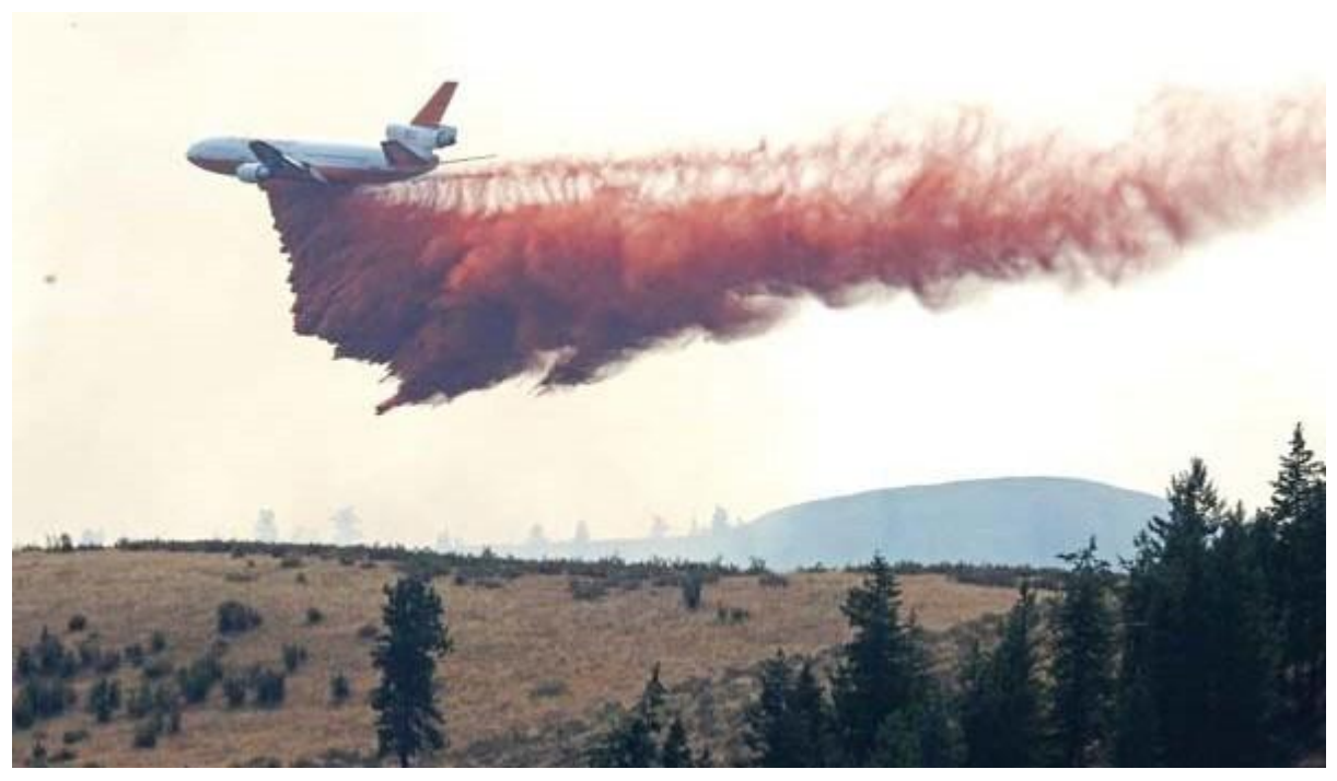
An air tanker drops retardant

© Photo by Mary Kiesau. All rights reserved. Click here to view Methow Valley News source.