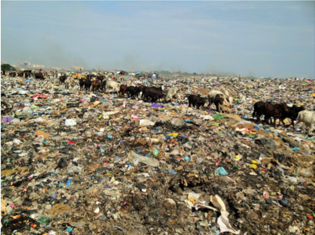
Cattle feeding among the waste dumped at Agbogbloshie.