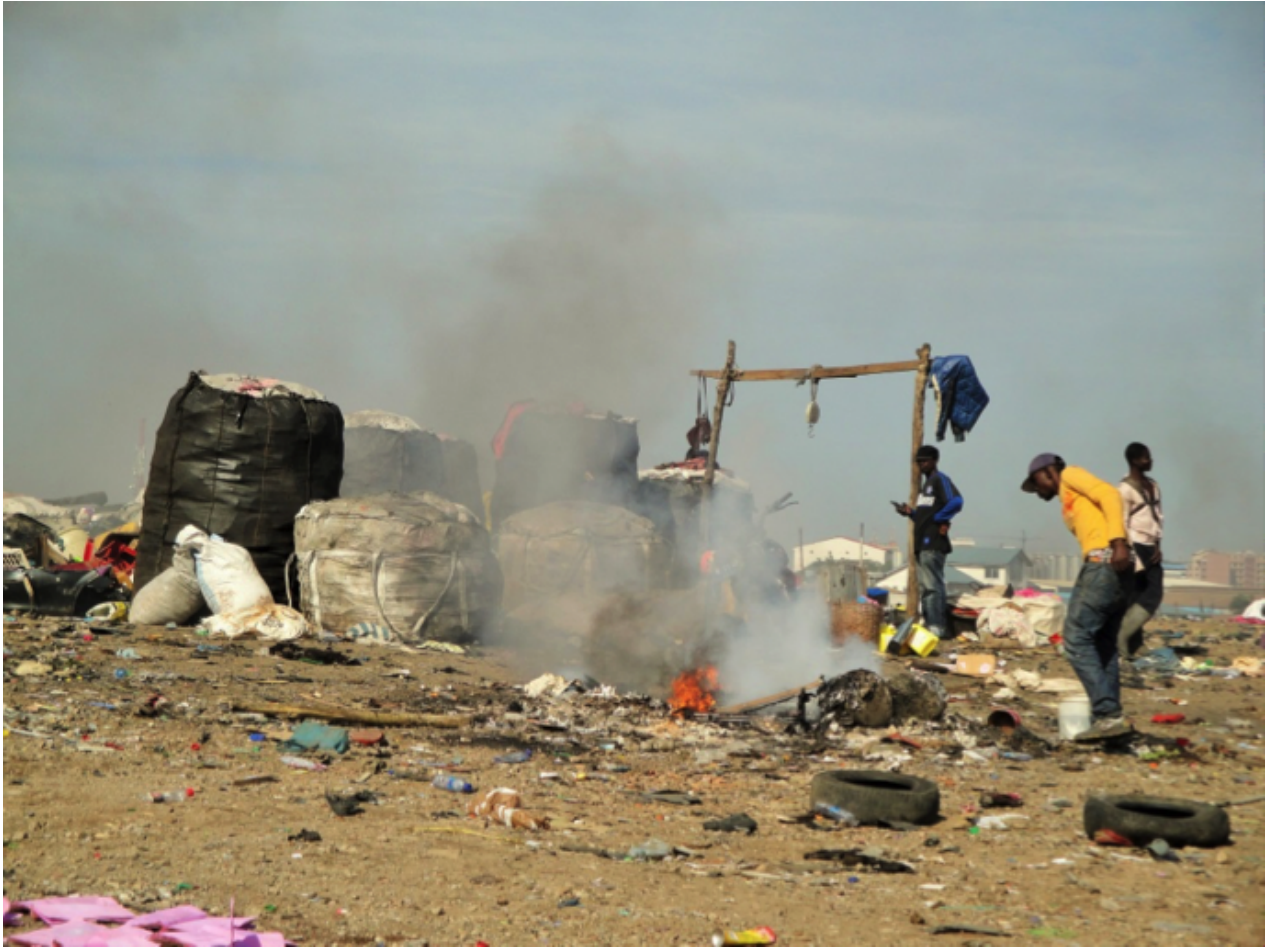
Burning tires to scavenge the steel belt wire.