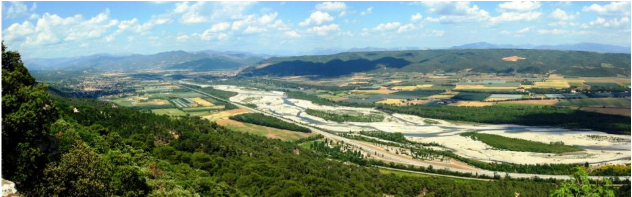
The Durance Valley in 2011 with some remaining floodplain segments during a summer low-flow period (looking upstream from the right bank)

nutrient-rich alluvial soils along the riverbanks. Then, a strong sediment flow reduction was quickly noted behind numerous reservoirs, which were problematic for water supply systems like the Canal de Marseille in past centuries. This flow reduction had a direct impact on both the Rhône River delta subsidence and the coastal erosion of the famous Camargue Biosphere Reserve.