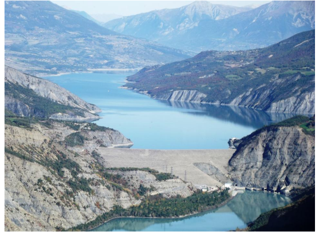
The Serre-Ponçon dam and the lake in 2013 (looking upstream from the left bank)

Historic photography (postcard) modified by Nicolas Maughan, 2014.