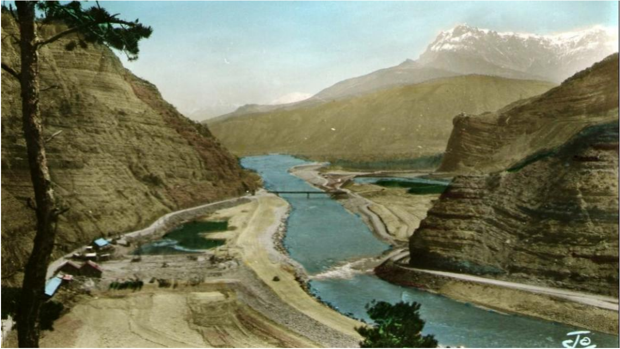
The Serre-Ponçon Valley and the Durance River before the construction of the dam (early twentieth century, south of the French Alps) Historic photography (postcard) modified by Nicolas Maughan, 2014.