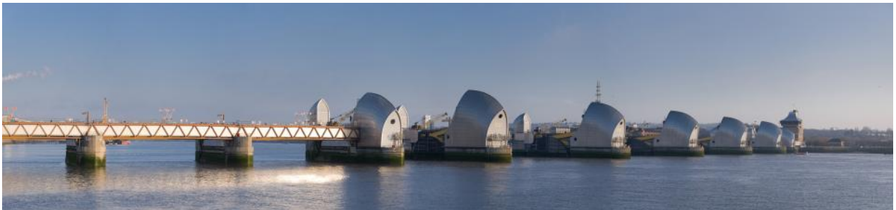
The Thames Barrier from the north bank of the river at Silvertown, in normal (open) operation

It was the catastrophic North Sea Flood of late January 1953 that caused over 300 deaths in the UK that eventually led to the barrier's construction. Although London was largely spared from the flooding, the scale of the devastation elsewhere in the country led to a renewed assessment of London's vulnerability to flood. A committee who reviewed the floods recommended that investigations into the possibility of a barrier be undertaken. However, it wasn't until a further review by Sir Herman Bondi in 1967, itself triggered by the devastating floods in Hamburg in 1962 , that serious progress on the proposal happened. The Thames Barrier Act was finally passed in 1972.