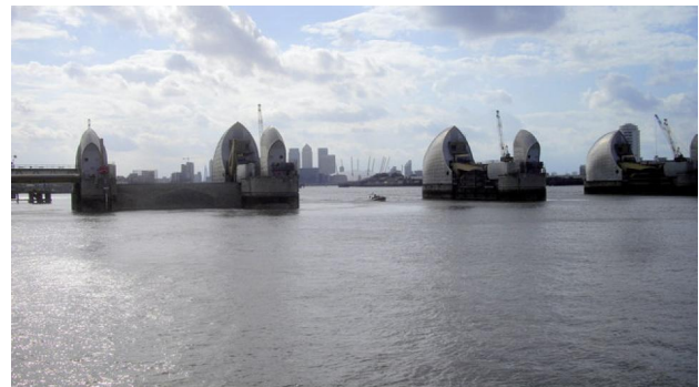
The Thames Flood Barrier

This work is licensed under a Creative Commons Attribution-ShareAlike 2.0 Generic License .