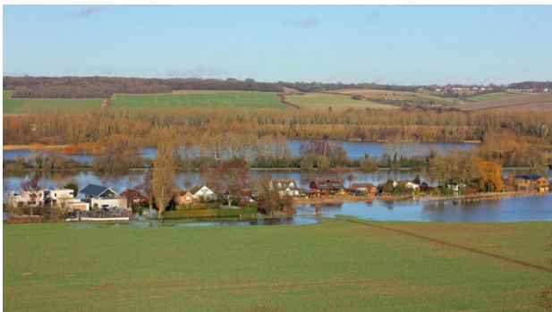
River Thames in Flood near Marlow

The Thames Barrier is a moveable flood defense located on the River Thames, downstream of central London in the United Kingdom. Spanning a cross section of the river 520 meters wide, the barrier is the second longest movable flood barrier in the world, after the Netherlands' Oosterscheldekering (Eastern Scheldt storm surge barrier). Operational since 1982, the Thames Barrier was built to protect the densely populated floodplains to the west from floods associated with exceptionally high tides and storm surges.