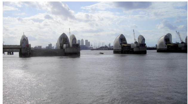
The Thames Flood Barrier

This work is licensed under a Creative Commons Attribution-ShareAlike 2.0 Generic License .