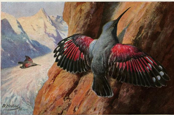
Der Alpenmauerläufer die gefiederte Alpenrose des Naturschutzparkes im Großglockner-Gebiet.

Kingfisher and wallcreeper as icons for Verein Naturschutzpark's ambitions to create nature parks in the "typical German landscapes" of heath (Lüneburger Heide) and Alps (Hohe Tauern)