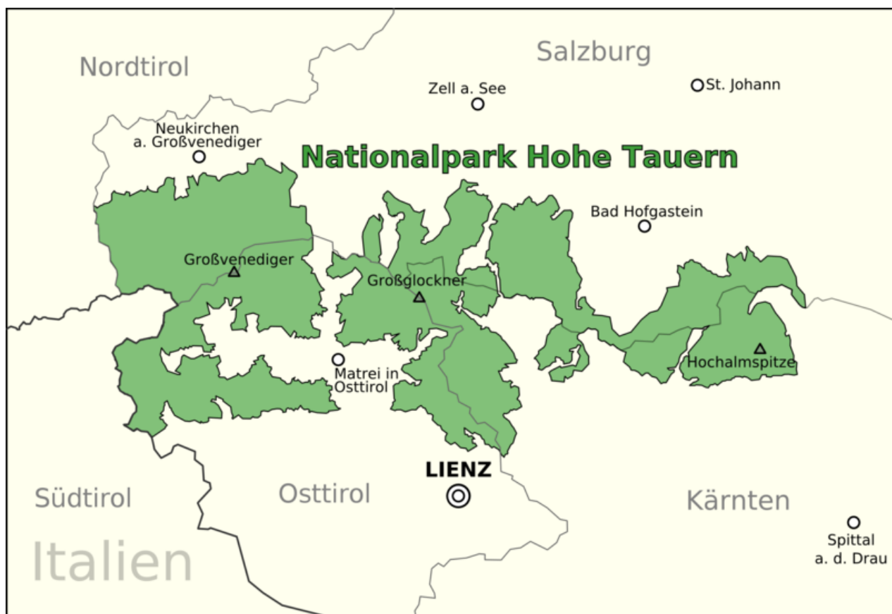
Map of the Hohe Tauern National Park

Besides the upheavals caused by war, harmonizing (or deflecting) social interests was the main reason for the time-consuming process of achieving the designation of the national park. Bringing proponents and opponents closer together and mediating between local needs and international standards took many very small steps. Hardly any other national park featured as many land owners who needed to be convinced of the significance and benefits of such a project. A 1995 mission statement called it “a miracle of spatial planning and conservation.” This miracle did not come about through divine or human intervention but was the result of endless talks and of mobilizing new sources of income for the region.