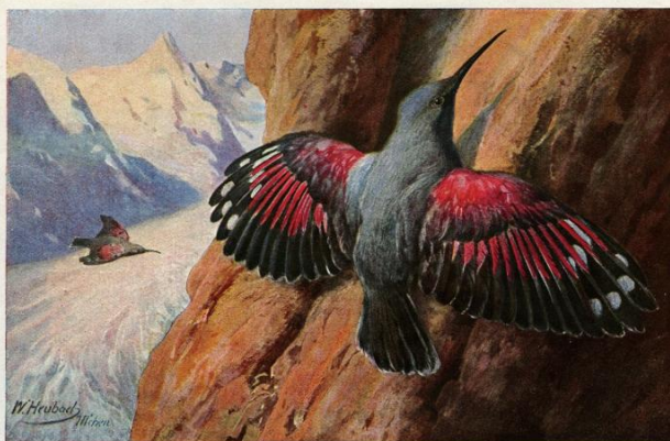
Der Alpenmauerläufer die gefiederte Alpenrose des Naturschutzparkes im Großglockner-Gebiet.

Kingfisher and wallcreeper as icons for Verein Naturschutzpark's ambitions to create nature parks in the "typical German landscapes" of heath (Lüneburger Heide) and Alps (Hohe Tauern)