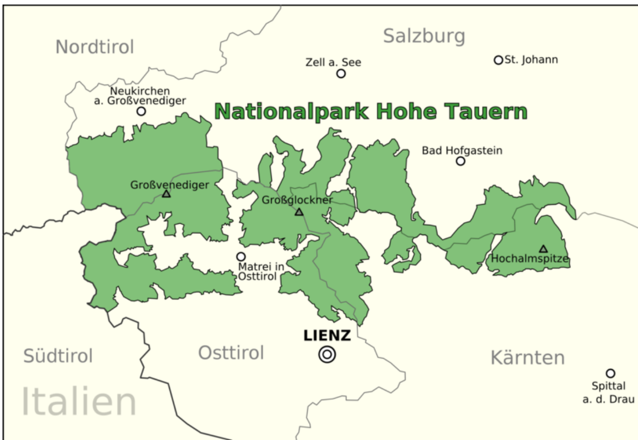
Map of the Hohe Tauern National Park

Besides the upheavals caused by war, harmonizing (or deflecting) social interests was the main reason for the time-consuming process of achieving the designation of the national park. Bringing proponents and opponents closer together and mediating between local needs and international standards took many very small steps. Hardly any other national park featured as many land owners who needed to be convinced of the significance and benefits of such a project. A 1995 mission statement called it “a miracle of spatial planning and conservation.” This miracle did not come about through divine or human intervention but was the result of endless talks and of mobilizing new sources of income for the region.