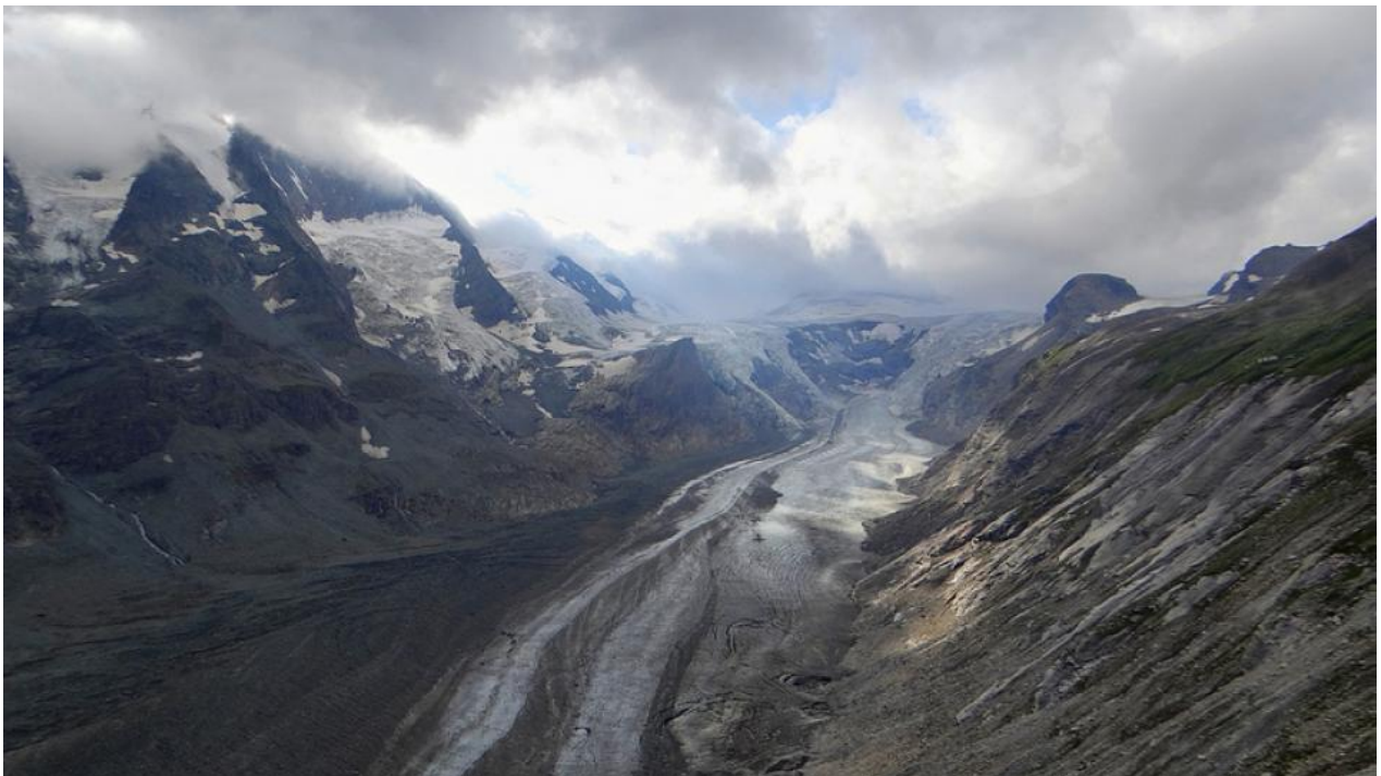
The Pasterze glacier in the Hohe Tauern National Park

Between 1981 and 1992 the Austrian federal states of Carinthia, Salzburg, and Tyrol established the Hohe Tauern National Park in the Alpine mountain range of the same name. As the country's first national park the reserve occupies a model position in Austria. In a larger spatial framework, however, the pioneer park can be seen as a latecomer with all neighboring countries having considerably older national parks.