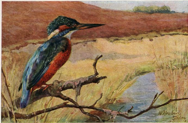
Der Eisvogel der gefiederte Edelstein des Naturschutzparkes in der Lüneburger Heide.