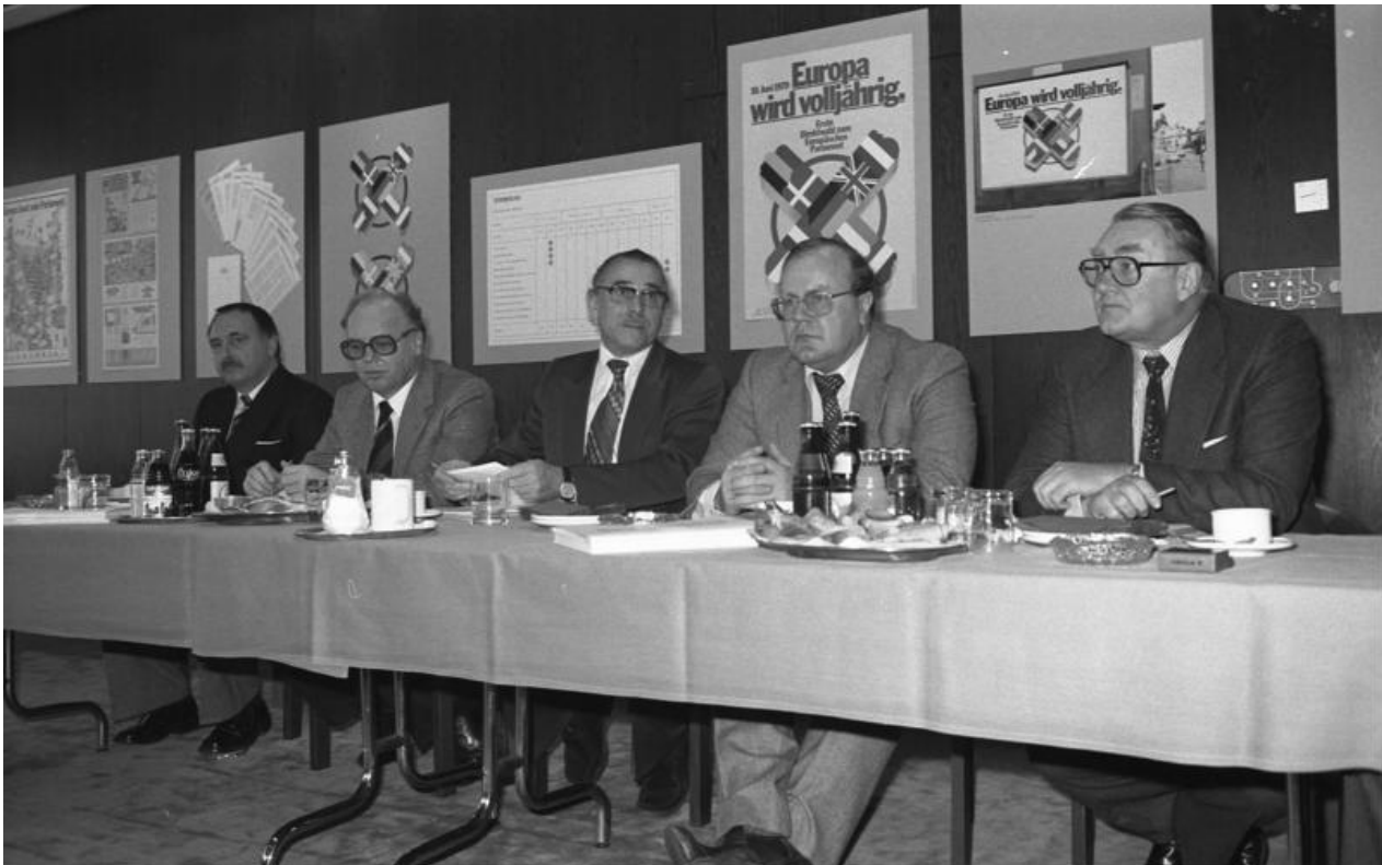
25. Januar 1979