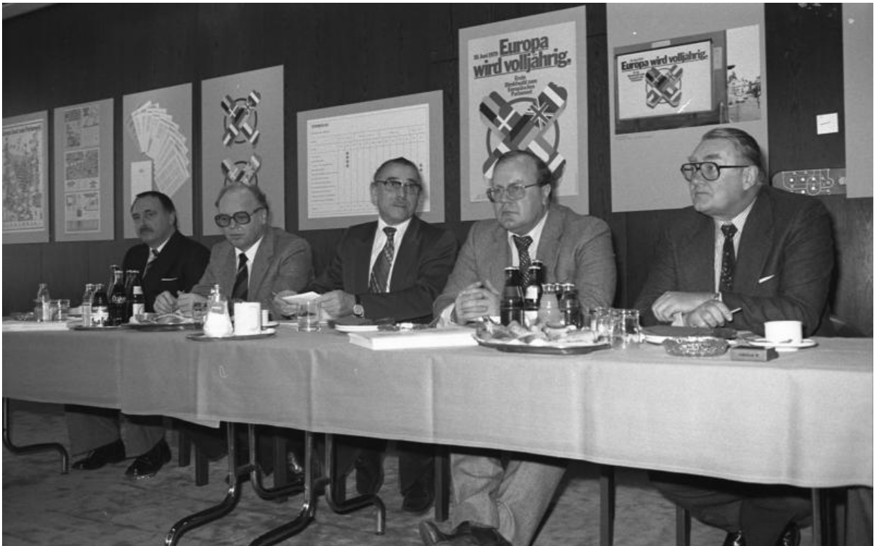
25. Januar 1979