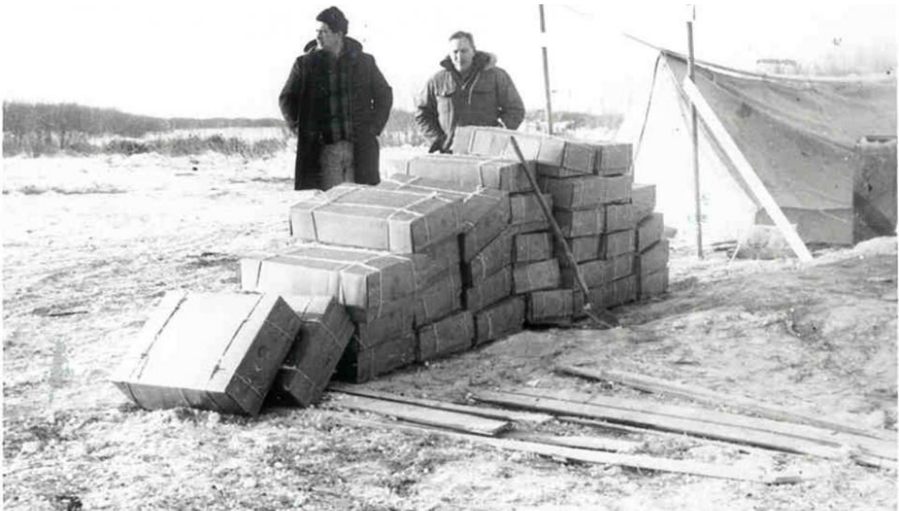
Bison meat ready for shipping from Hay Camp, Wood Buffalo National Park (1952)

Periodically, the goals of disease control and commercial development came into conflict, particularly when the federal government's northern administration began to actively promote bison meat as part of a much broader program of economic development in the region.