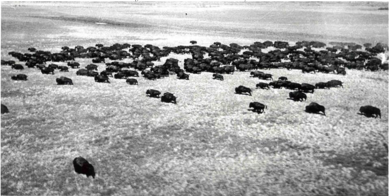
Bison population survey photograph, Wood Buffalo National Park (17 July 1946)

In 1922, the Canadian government established the Wood Buffalo National Park in order to protect a remnant herd of the wood bison. The park claims many distinctions: it is North America's biggest national park (and the world's second biggest at 44,807 km 2 ), a UNESCO World Heritage site, home to the largest free-roaming herd of wood bison, the first federal park in Canada's territorial north, summer home to the last major migratory flock of whooping cranes, and the largest dark-sky reserve on the planet. However, the park's wildlife has also been subject to some of the most intrusive and ill-conceived management interventions in Canadian history.