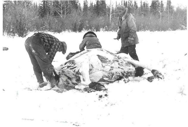
Hunters skin a bison as part of the 1948 slaughter, Wood Buffalo National Park.