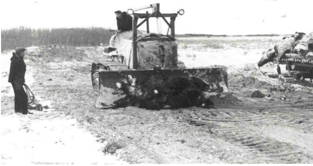
Bulldozing a slaughtered bison toward the Hay Camp abattoir, Wood Buffalo National Park (1952)