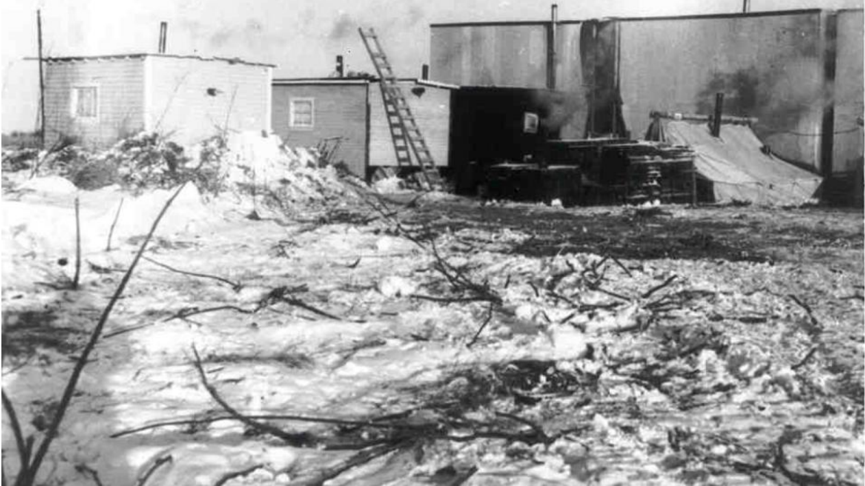
The Hay Camp abattoir (1952)