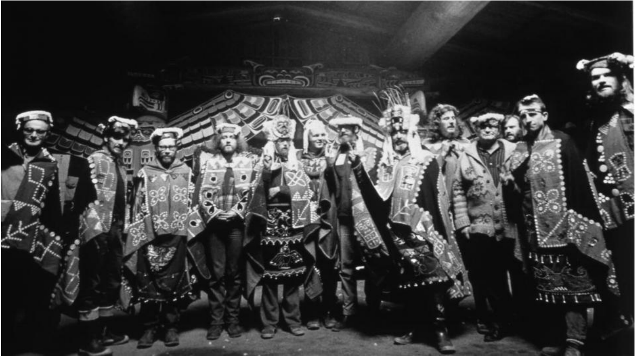
The original “Rainbow Warriors” visit Kwakiutl Indians in their longhouse (1971)