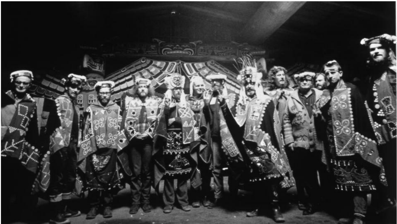
The original “Rainbow Warriors” visit Kwakiutl Indians in their longhouse (1971)