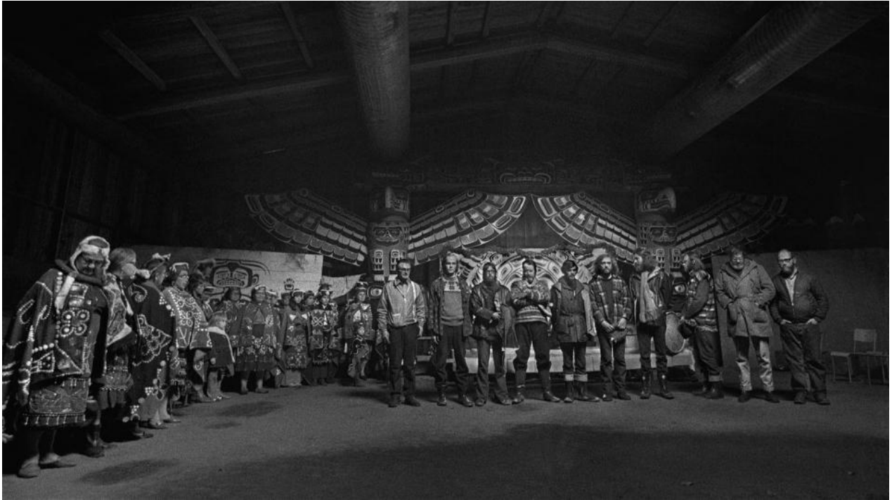
Greenpeace members are invited by the Kwakiutl tribe of British Columbia to a special tribal initiation ceremony