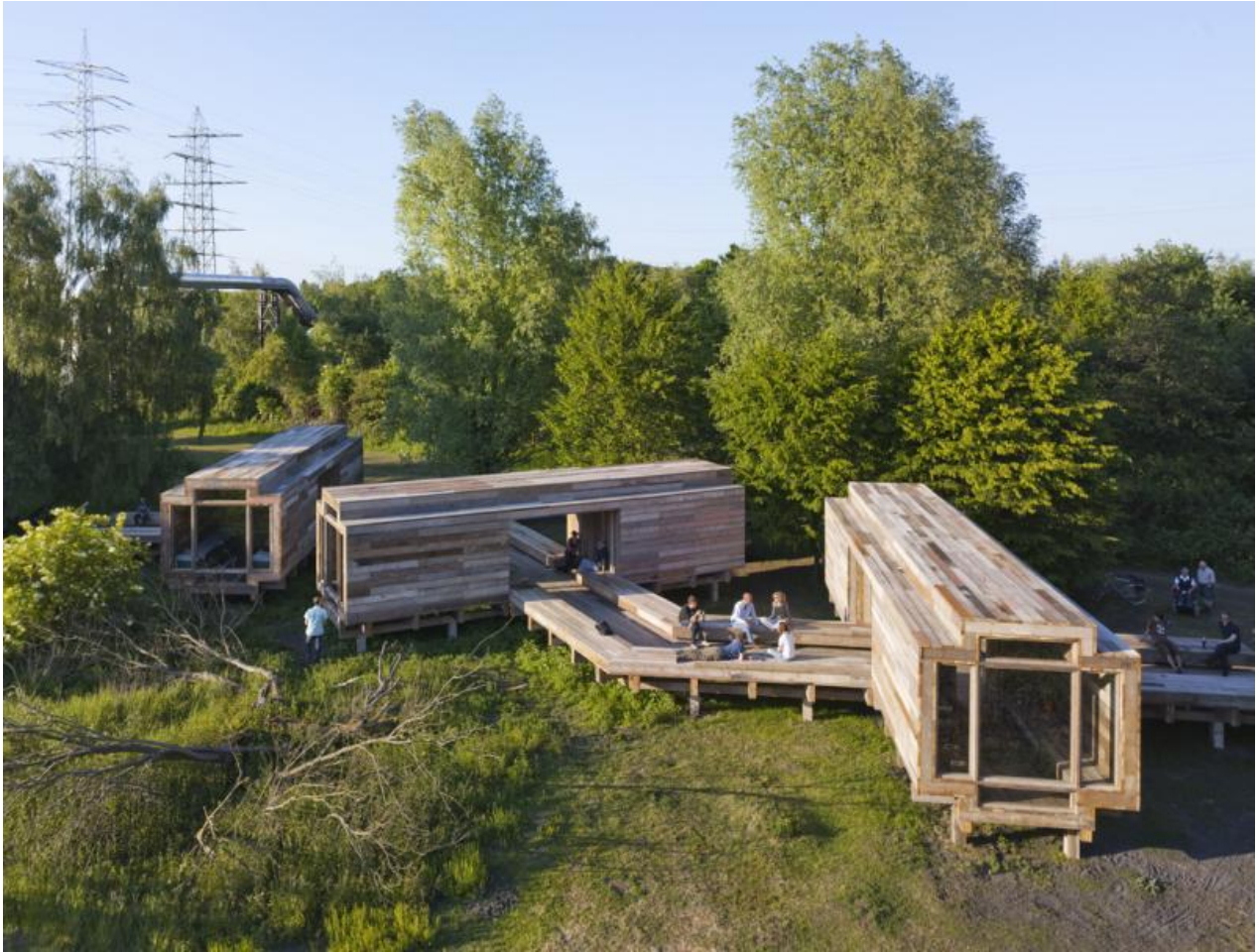
Observatorium's Waiting for the River (2010).

Since 1997, the artist group Observatorium is committed to create relationships between art, landscape and society.