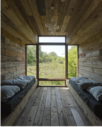
Inside Observatory's Waiting for the River