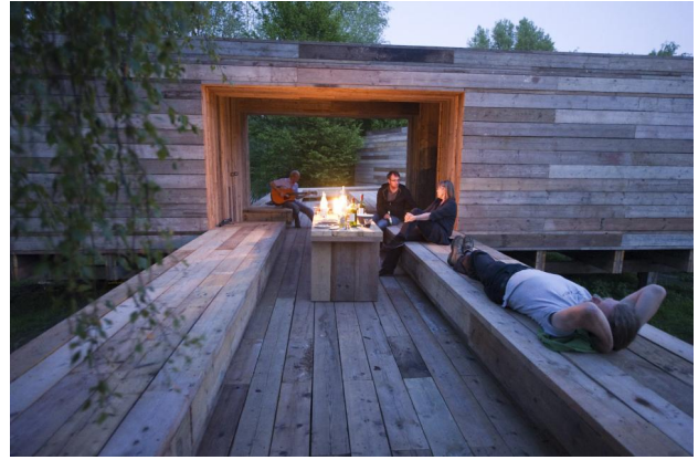
Observatorium's Waiting for the River , inviting contemplation

Located at Essen-Altenessen, by the mouth of the Schwarzbach, northeast of the Schurenbach Mine waste heap.