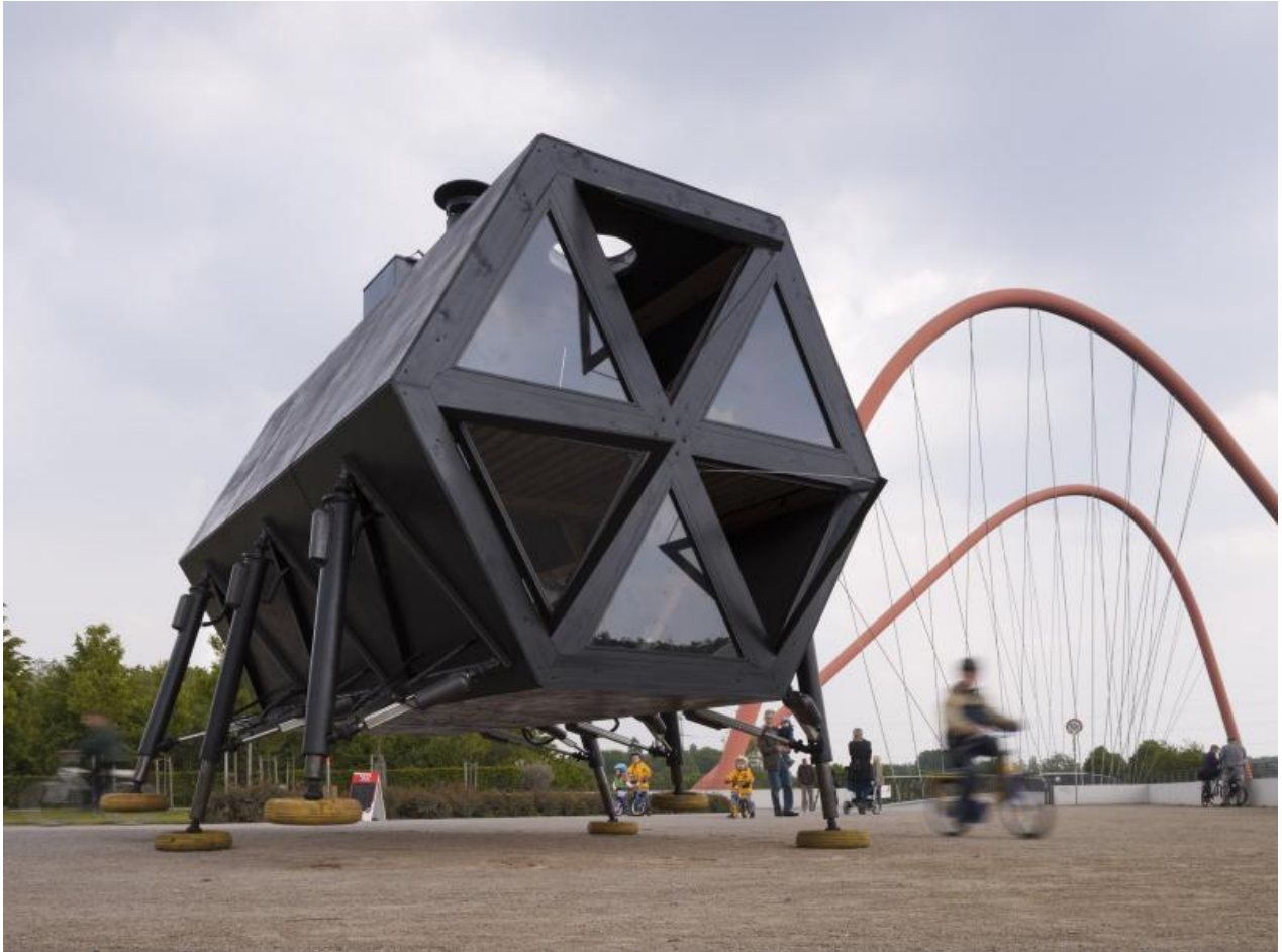
Walking House by N55 (2010), seen here at the former site of the Nordstern Mine in Gelsenkirchen.

Please click here for the manual that accompanies this work.