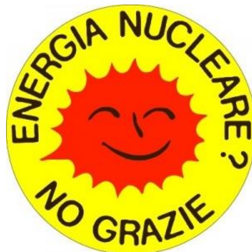
Italian anti-nuclear logo "Nucleare No Grazie!"

The copyright holder reserves, or holds for their own use, all the rights provided by copyright law, such as distribution, performance, and creation of derivative works.