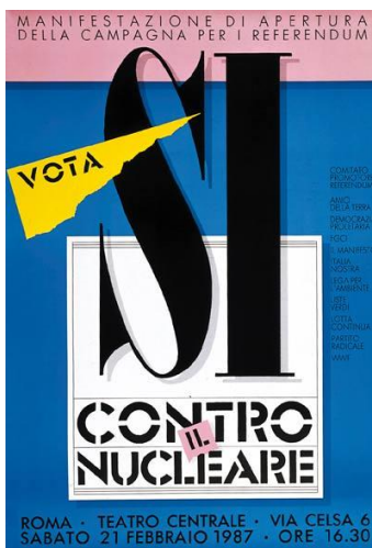
Manifesto of the opening event of the referendum campaign

However, only the widespread popular fear of the radioactive cloud produced by the explosion of one of Chernobyl's reactors triggered the requisite political momentum. In the accident's aftermath two major parties, the Socialist Party (part of the ruling coalition) and the Communist Party (opposition), both traditionally in favour of nuclear power, backed the anti-nuclear referendum campaign. Even the Christian Democrats, the leading party in power, feared losing votes over the issue and turned the referendum over to its supporters as a question of individual conscience.