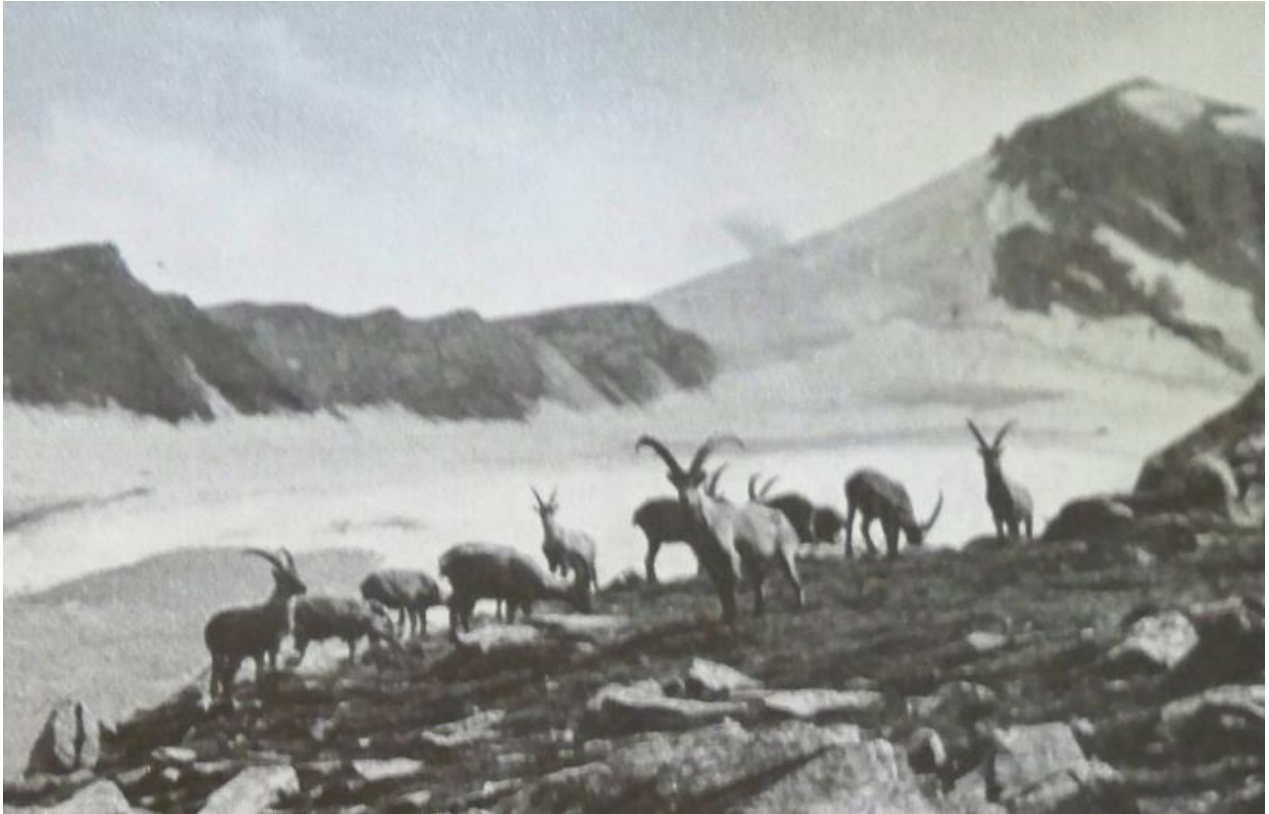
Ibex in the Gran Paradiso National Park (1933)

1933