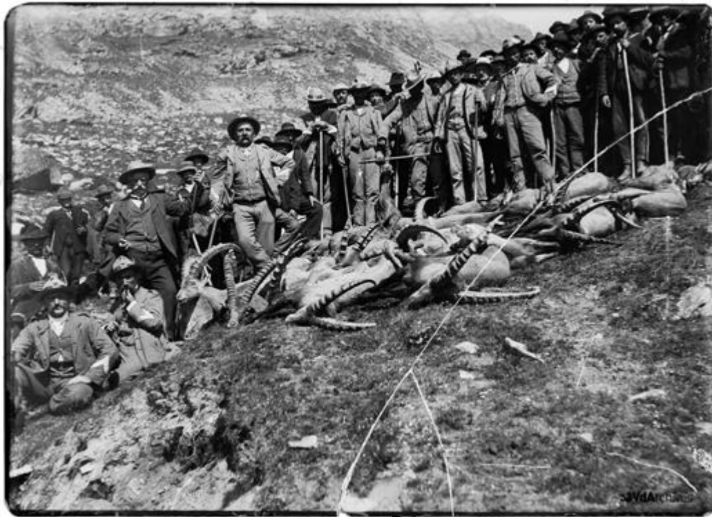
A scene from the royal hunts in the Gran Paradiso area, early 20th century