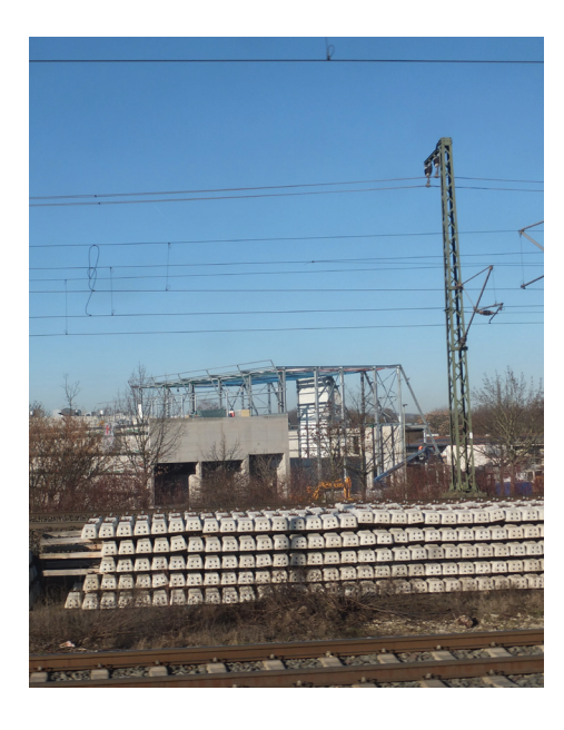
Figure 1 Commercial buildings north of Göttingen constructed in 2019 on what was previously green space

The wide valley of the Leine River between Göttingen and Hanover is, relatively speaking, a peaceful place. On both sides of the dale are rolling hills full of green trees. Sometimes a medieval tower shines through, recalling times when knights controlled the dues of merchants passing from Kassel to Hanover. Yet, in parts of the valley, the view is far from empty and less than beautiful. Several highways, the national A7 freeway, and four railway tracks cut through the landscape, which is flooded with industrial developments and residential housing near Göttingen (fig. 1).