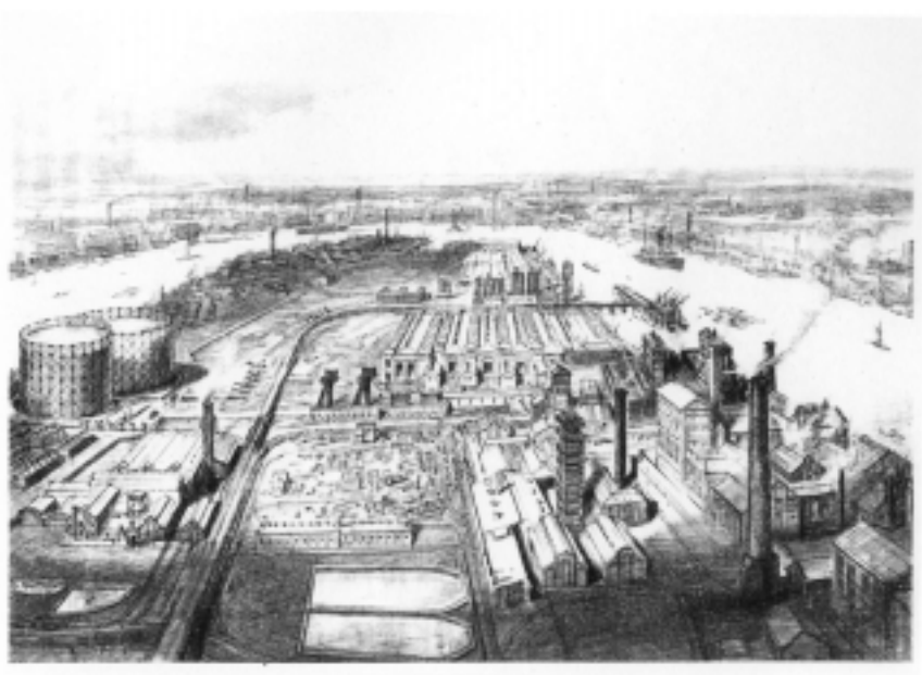
EAST GREENWICH WORKS (German Yura)