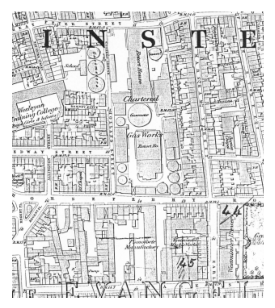
FIGURE 3. Gas Light and Coke Company Works in Westminster, 1869. Note its proximity to houses, schools, and a brewery. Detail from the 1869 Ordnance Survey Map of London, RM 21\XLIII SE.

complained that their wells had become contaminated 'by the draining and passing of water and liquor of a deleterious nature from the . . . Gas Light and Coke Company in Peter Street'. As a result, the brewery could no longer use its own well water to make beer. The gas company, anxious to avoid a civil suit, paid the brewers £500 compensation in exchange for an indemnity against all past and future damage. Three years later, the company paid £790 to the owners of another