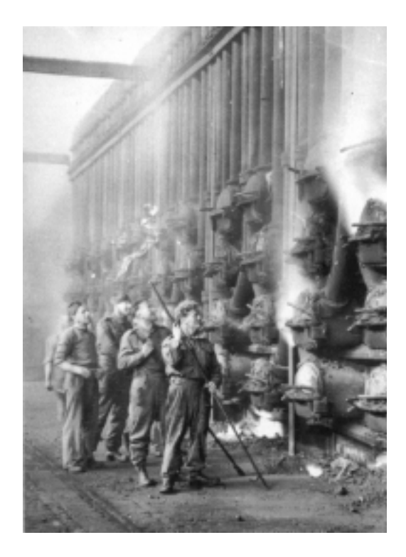
FIGURE 1. Troops working in a retort house during a gasworkers' strike in Manchester, 1945. Accession no. 144792.

gasworks provided 'ample arrangements for the comfort of the stokers'. These reassuring words were belied, however, by warnings that the sulphuric acid fumes that filled the air of retort houses would eat through unprotected iron. Expressing greater concern for damage to property than to people, the book noted that even galvanised nails had to be coated with tar to prevent their being 'rapidly destroyed by the action of the gases and vapours necessarily present in buildings of this description'. Gas workers, in an effort to secure not only better wages and shorter hours but also improved health and safety standards, formed a labour union in 1889. Will Thorne, who organised and led the National Union of Gasworkers and General Labourers, possessed an intimate knowledge of the conditions in gasification plants. When he had worked at the Saltley gasworks in Birmingham, Thorne's job had required him to discharge coke from the ovens. Each time an oven door was opened, a puff of hot gases would burst out and explode into flame as it mixed with oxygen in the air (Figure 1). Describing conditions in the retort house, he recalled, 'The work was hot and very hard. As