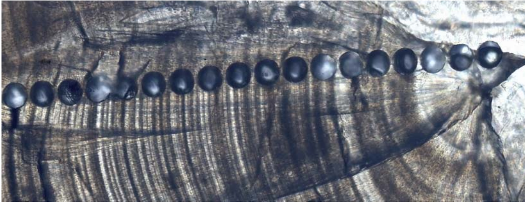
Figure 4. An otolith cross-section that has been placed under magnification. The holes mark where samples for isotope analysis have been extracted with a laser ablation multi-collector inductively coupled plasma mass spectrometer.

vary depending on the water through which a fish swam. Not only does saltwater have different trace minerals from freshwater, but different streams, and even different parts of the same stream, have different mineral contents depending on the types of rocks over which they flow. 51