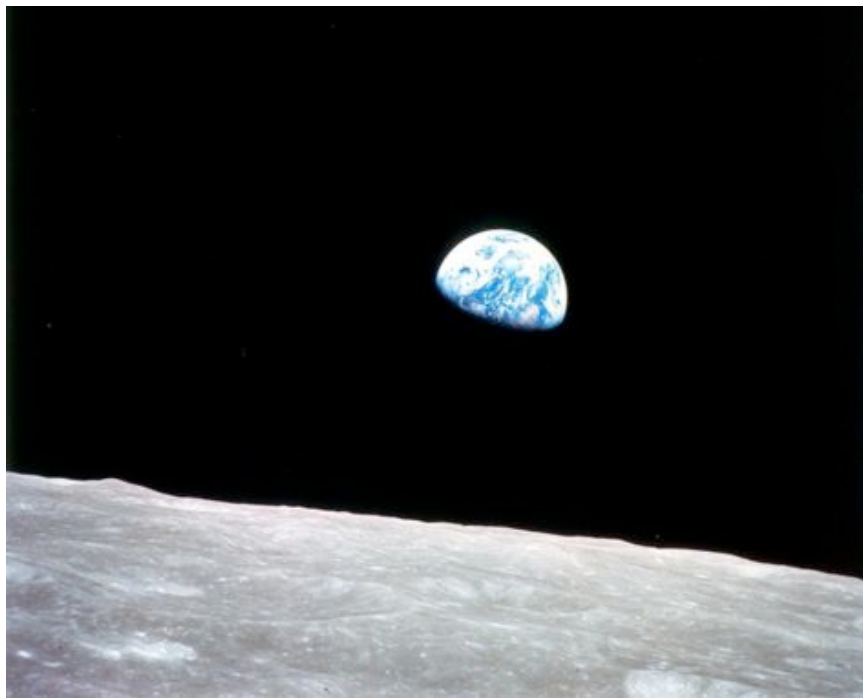
Figure 2 "Earthrise".

What all Whole Earth images have in common by definition is the complete absence of any horizon, of any limitation to the human field of vision. Or rather, as another exemplary image, the Earthrise photograph captured by William Anders as he circled the moon aboard Apollo 8, makes especially clear, the entire planet seems suspended within the same horizon, suggesting an experiential fusion of all members of the human race, regardless of ethnicity, creed, nationality, or socio-economic status. In almost no time at all, Whole Earth images became the most potent icon of the nascent environmental movement, providing seemingly incontrovertible proof that whatever else might separate us, we are all part of one species , forced to live together on the same fragile planet and sharing the same limited resources. They adorned the covers of Steward Brand's Whole Earth Catalog (published from 1968 to 1972), featured prominently in the Earth Day celebrations that were first held in 1970, were printed on beach balls tossed around at hippie gatherings, and inspired widely-read manifestos by Buckminster Fuller, Marshall McLuhan, James Lovelock and others. 3 Forty years later, the appeal of these images has not waned one bit, and they can be found on the covers of both popular calls for ecological action (e.g. Al Gore's An Inconvenient Truth , 2006) and academic publications within the burgeoning field of the environmental humanities (e.g. Karen Thomber's Ecoambiguity , 2012).