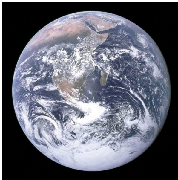
Figure 1 "The Blue Marble".

If asked to summarize the cultural effects of Gagarin's journey, one could do a lot worse than to speak of the "abolition of human horizons." Just a year prior to Gagarin's liftoff, the German philosopher Hans-Georg Gadamer had influentially described the process by which we make sense of historically distant or culturally alien experiences as a "fusion of the horizons of understanding." 2 But as the cosmonaut ascended into orbit in a tiny capsule that with its darkened interior and miniscule portholes resembled nothing so much as a camera obscura , something entirely different happened. Gagarin could literally watch as his horizon of understanding expanded ever outward, eventually becoming identical with the circumference of the earth. On this early flight, only Gagarin's retinas were exposed to this new experience, but over the course of the next decade, the American Apollo missions began broadcasting what came to be known as the Whole Earth images to a spellbound planetary audience. The most famous of these was the so-called Blue Marble picture of 1972.