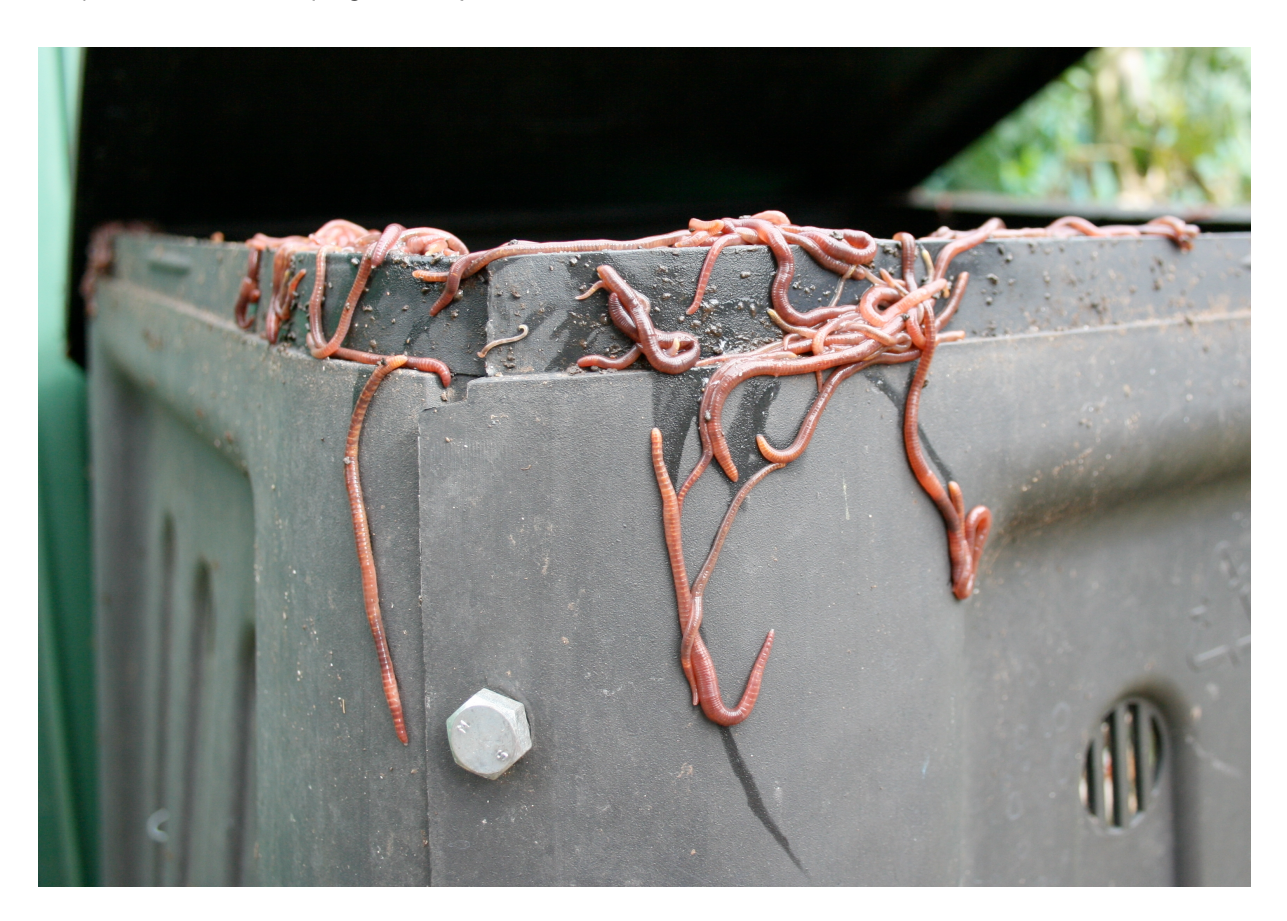
Figure 2 Escaping worms.

From one day to the next, close to 20 worms had left the bin on Sebastian's balcony in Amsterdam. In the darkness of the night, they crawled out and ended up on the tray that he kept underneath the wormery. As usual, he had given them food; he had let them breath during the day by leaving an open space between the lid and the box; and earlier in the week he had created little pockets of air by scooping around the soil. So, why did they escape?