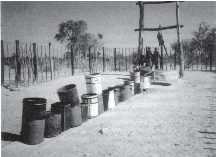
FIGURE 2. Tins in a line, waiting for the pump to open

During the 1980s water supplies continued to be caught up in political conflict and the legacy of this continues even into the 1990s. By Independence it is estimated that at least 50% of boreholes were out of order (LWF 1989), a situation which must have led to considerable crowding at working facilities and a heavy reliance on scarce surface water supplies. 2