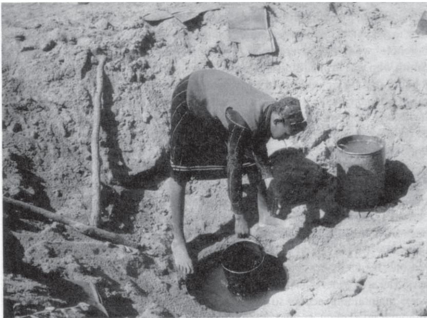
FIGURE 3. Taking water from a well in the dry bed of the Shanagami River

Water continues to be a significant factor in determining compliance with or resistance to state directed development. The very slow progress being made in Nkayi with the Villagisation and Land Use Planning exercise is made no better by the recalcitrance of households who refuse to move out of designated 'grazing areas' into 'lines' of settlement. Many such families live close to the river beds and give easy access to 'sweet' water as a prime reason for refusing to move. They point to the queues often seen at boreholes and refer to the 'salty' or 'oily' quality of borehole water as evidence that their lives would be considerably worsened by such a move.