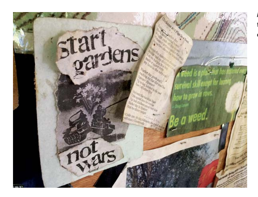
Figure 3. Mantras for the more-than-human economy.

rooted, and often refuse to leave. At Clearwater Creek they are a more-than-human muse, a role model in their reclamation of scarred spaces. Contrarian to the monocultures of modernity and mind where "everything else becomes weeds or waste," Sally sees her life's work as a punk project, a refusal to be domesticated, a resilience in the face of adversity, a steward of the soil.