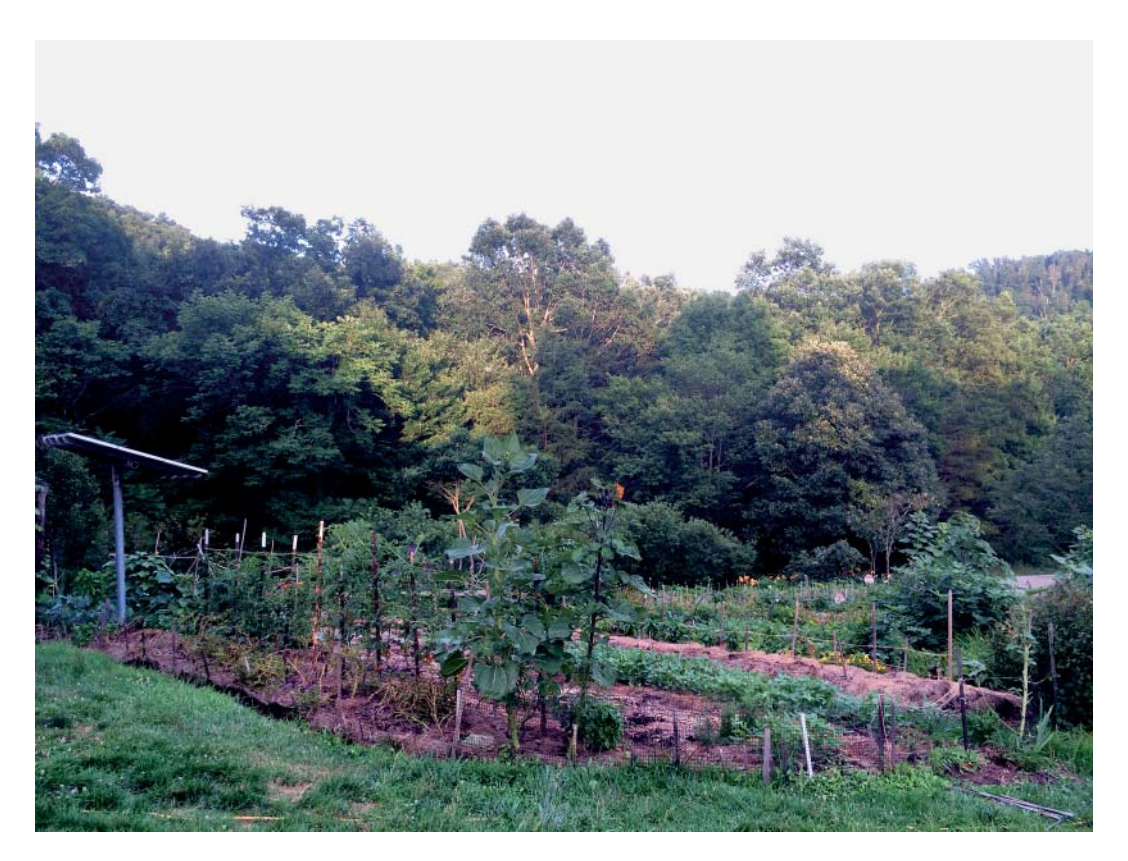
Figure 1. A landscape of multispecies mutualism.

each other or not at all."<sup>24</sup> In considering compost, Haraway thinks with Maria Puig de la Bellacasa to argue that soil, compost, and the whole range of human economic and ecological relations are not only "matters of concern" but also "matters of care."<sup>25</sup> They demand consideration and a commitment to foster the conditions of their flourishing. Composting is a vital element of permaculture that likewise offers a fertile site to expose and explore the ethical entanglements of humans and their others. As a principled praxis of caring for the earth, caring for people, limiting consumption, and returning the surplus, permaculture proposes a life-sustaining interdependency committed to holistic closed-loop systems. Among permaculture's many design principles, several capture something of the ethic and ecology of the agricultural approach—Use Edges: Value the Marginal; Produce No Waste; Value Diversity.