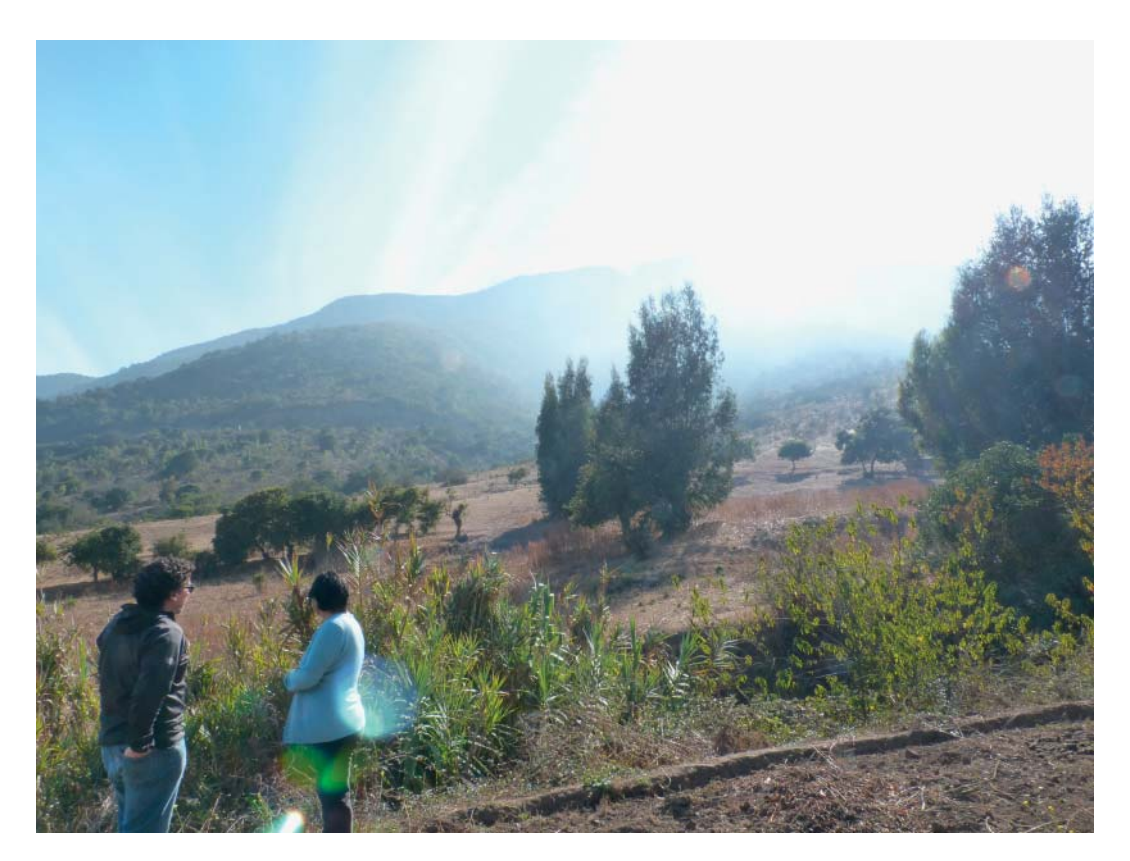
Figure 2. Gloria and the cloud in Los Maquis.

Puchuncaví's atmosphere. But still. Sometimes I cannot help feeling, as on that gloomy morning, suspended in Puchuncaví—suspended in time, in action, and in airborne toxicants. Suspended as a somatic and a political condition.<sup>33</sup> And it is not just me. I remember one of my last visits. We were in Los Maquis, up in Puchuncaví's valley, where the plume from the smelting plant concentrates. I was outside with Gloria, looking at her lemon and avocado trees, when she suddenly looked up to the hills and said, half worried, half excited, "Look! That's the cloud—the one we were talking about before, the one coming from the smelting plant. Can you see it has a blueish hue? That's toxic." And yes, there it was, haunting us, the cloud that accompanies life in Puchuncaví. In Puchuncaví, bodies are air-conditioned (fig. 2).