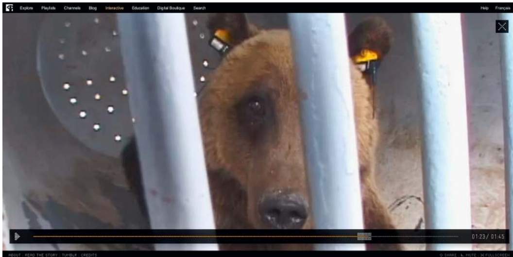
Figure 1. Bear 71 peers out of a cage before being released into Banff National Park with her new radio collar. Bear 71 ©2012 National Film Board of Canada. All rights reserved.

with the bear's capture, the film suggests that bears are thus interpellated into a system of wildlife management that forces them to give signs—to speak and communicate—of their existence to humans. Bear 71 notes that the radio collar thereafter is “constantly beeping my location to some ranger playing God.” Bear 71 's creators explain that after her collaring, “She lived her life under near-constant surveillance. . . . She was tracked and logged as data” (fig. 1). Wildlife conservation officers “tracked and logged” data about Bear 71 in order to gather information about the endangered grizzly bear population; the anthropomorphized narrative of Bear 71 reassembles the data into an invitation for viewers to listen to the singular experiences of the bear. Christine Biermann and Becky Mansfield argue: “Managing individual nonhuman lives is meaningless in responding to the crisis of biodiversity loss; individual lives acquire meaning only when they advance the long term well-being of the broader population.” 6 Bear 71 's autothana-tographical narrative reframes wildlife conservation data into an affective mode of communication and address from the individual animal that gestures beyond the biopolitical tendency of species conservation.