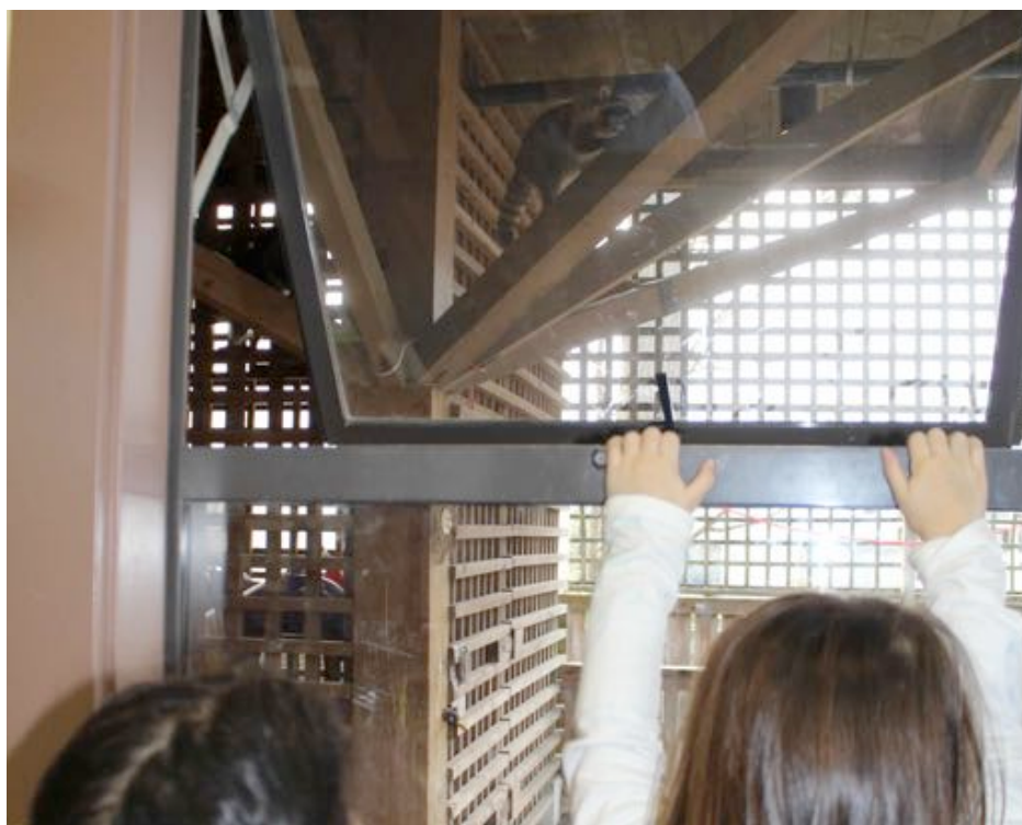
Figure 1. Children watch the raccoons through the window.

The children's and educators' curiosity about the raccoons is tinged with disconcertment. Humans in the childcare centres are taken aback by the raccoons' similarities to them. Recognizing themselves in these racoons, they are attracted to them. This process is akin to what Levinas calls an 'ethics of recognition,' where we see ourselves in the face of the other. 27 However, the educators are threatened by the raccoons' bold wild-nature / domesticated-urban boundary-blurring behaviours. Even more provoking for humans is raccoons' 'naughtiness;' they are tricksters and jokers who sabotage carefully planted garden boxes, vandalize trash cans, rearrange the playground, tap on the classroom skylights, and play with the children's toys. These raccoons defy authority, resist human plans, ignore divides, and deviate from the expected path. In other words, they live up to their reputation as 'masked bandits' full of mischief.