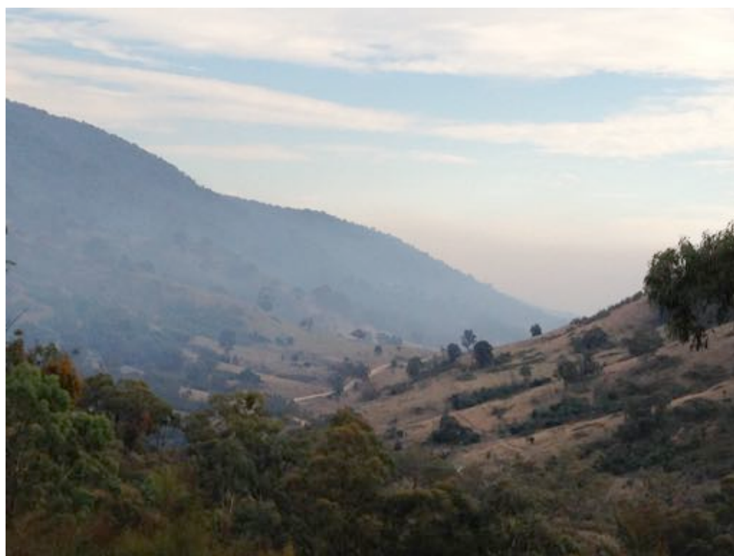
Figure 1. Wee Jasper Valley.

She drives down the valley past the paddocks and fences, sheep and cattle, past the 1080 poison signs warning of baiting for dingoes and wild dogs, and the kangaroo and wombat road kill. She is on her way to her home in the conservation reserve at the end of the valley. Her exhaust gases mix with a soft breeze carrying smells of gums and manure. At her place she lets the dogs out of the car and they rush off to harass the water dragons along the creek. As she enters her house she's greeted by the kookaburra and magpies who frequent her verandah. She