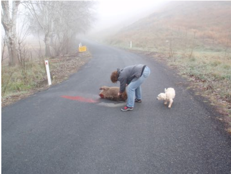
Figure 9. Dead wombat on the road to Wee Jasper.

Yet another grisly early morning discovery. It's a regular event. Because the blood's so red on the road, she wonders how long it's been since the wombat was run over. Her dog sniffs the body then backs off. It's very stiff. After dragging the dead wombat off the road, she girds herself and checks to see if there's a live joey. She can feel a lump. She's too squeamish to put her hand right inside the pouch, so she squeezes the joey to the entrance by pressing on the mother's abdomen. It's coming out. She can see and feel it now. It's hairless, still and cold. It must have frozen overnight. She returns to the car, feeling disappointed and relieved, shaky and sad. Her dog sniffs her hands.