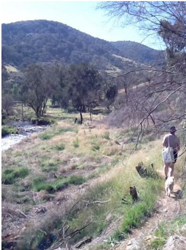
Figures 7 and 8. Walking the tracks beside Micalong Creek.