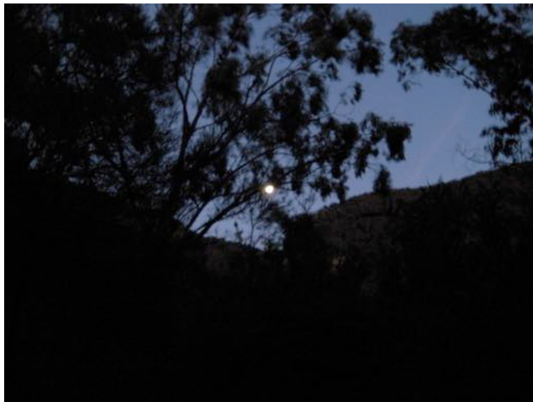
Figure 4. Dark night in Micalong Creek.