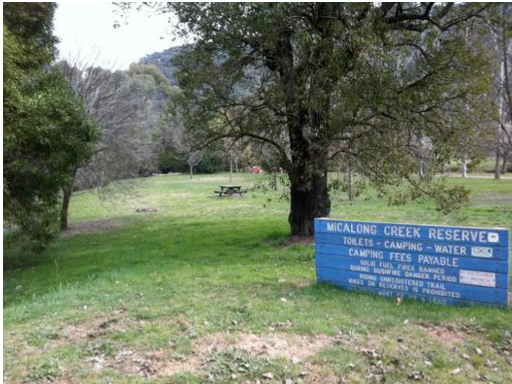
Figure 2. Micalong Creek Conservation Reserve.

unpacks the car, careful not to tread in the piles of wombat poo. A sparrow catches her eye and she wonders what to make of the mess of inheritance.