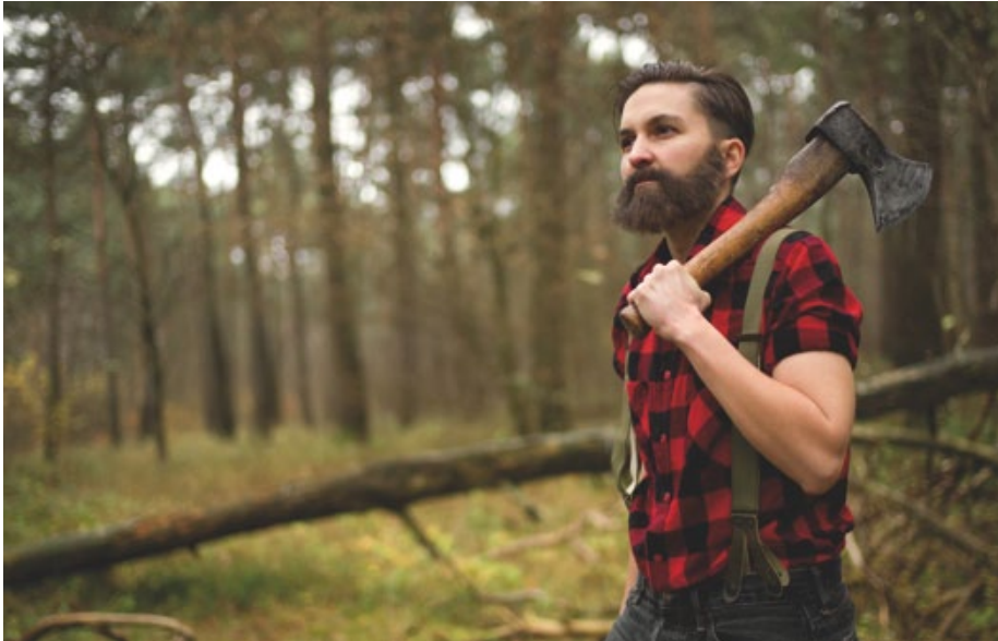
Figure 1: Boys will be boys— lumberjack , C-Print/ Alu-Dibond, 70 x 100 cm (2014).

An Art Installation: Staged Wilderness and Male Dreams