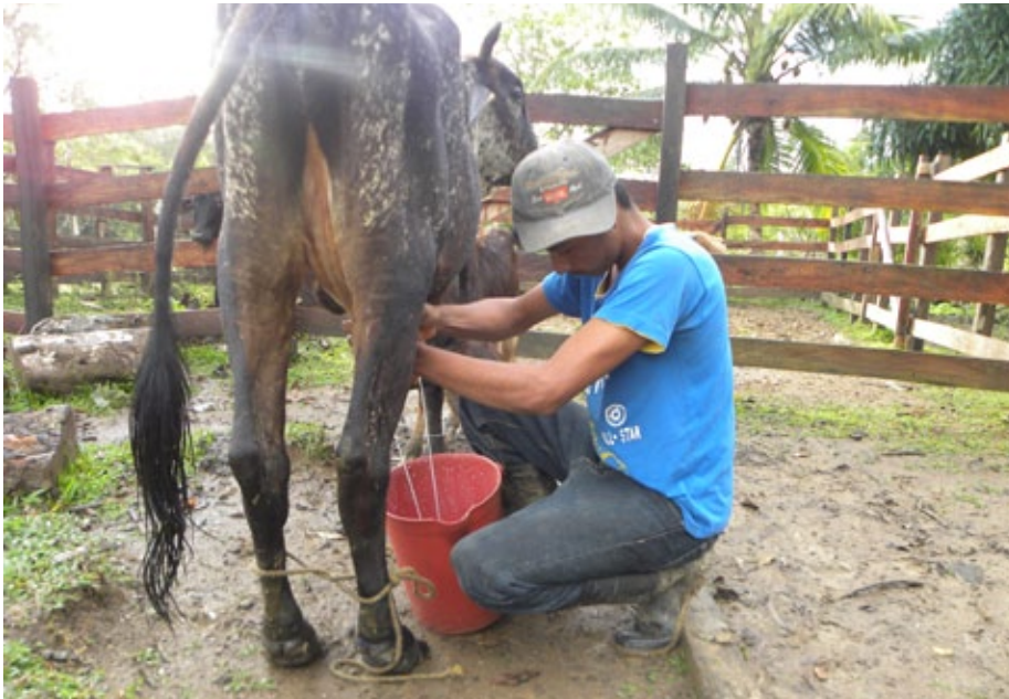
Figure 1: Smallholder cattle rancher milking a cow.

not matter if the animals belonged to them or not; the important thing was having the animals graze on their own pastures. It did not matter to large-holders whether the animals were grazing on their own pastures (they usually did not live on their farms anyway); the important thing was to own the greater number of animals. Both sides saw these arrangements as advantageous when it came to increasing men's social status. To be considered a "real man," a rancher needed to have as many cows as possible, no matter if this entailed deforestation in the short term.