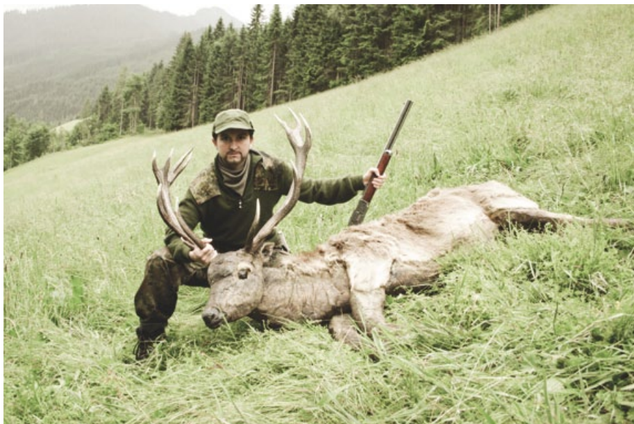
Figure 2: Jäger (hunter), photo print/acrylic glass, 40 x 60 cm (2014). Photograph by Martin Knobel.

We're left with little doubt that the performed activities are male activities, the jobs male jobs; that the chosen settings—a prairie, a forest, rough mountain scenes—represent settings where men are the masters and protagonists.