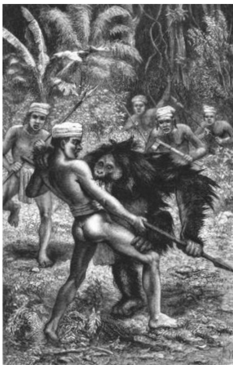
Figure 2. Titlepage illustration in Alfred Russel Wallace, The Malay Archipelago , 2 vols. (London: Macmillan & Co., 1869), II, v.

emotional life becomes entwined with that of the infant as he narrates his efforts to quell its crying. Having made “an artificial mother” out of buffalo skin, which the infant could grip onto, Wallace comments, “I was now in hopes that I had made the little orphan quite happy.” Like an affectionate parent, he finds that, when spoon-feeding the creature, “it was a never-failing amusement to observe the curious changes of