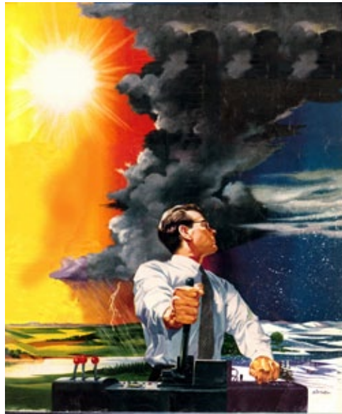
Figure 1: Cover illustration of James Fleming, Fixing the Sky (New York, NY: Columbia University Press). Used with per- mission from Columbia University Press.

In New Atlantis (1624), Bacon describes the scientists of Solomon's House practicing both observation and manipulation of the weather: "We have high towers . . . for the view of divers meteors—as winds, rain, snow, hail, and some of the fiery meteors also. And upon them in some places are dwellings of hermits, whom we visit sometimes and instruct what to observe . . . and engines for multiplying and enforcing of winds to set also on divers motions" (399). In great experimental spaces, researchers imitate and demonstrate natural meteors such as snow, hail, rain, thunder, lightning, and "some artificial rains of