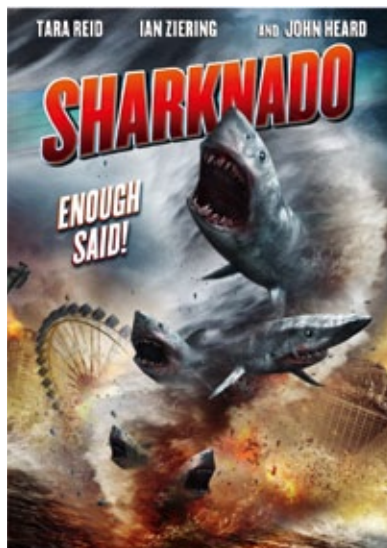
Figure 1: Sharknado movie poster.

Not surprisingly, this heroic idol tends to be a young, white, heterosexual man in prime athletic shape. As increased awareness of the devastating impact of human-induced climate change permeates societies all around the globe, more and more popular culture texts featuring extreme weather events—commonly known as climate fiction or "cli-fi"—are being published (Leikam and Leyda 2017). Due to their sensational plots and emotional thrills, they are being disseminated, appropriated, and emulated worldwide. In the following, I will briefly lay out why the study of these often highly commodified narratives fills current research gaps in the humanities. Then, I will analyze the disaster parody Sharknado (2013) as a case study, in order to show how its representation of the extreme weather hero exposes many of the subtle (and not so subtle) underlying assumptions framing our imaginations about environmental crises and the ways in which masculinity is decisively entangled with them.