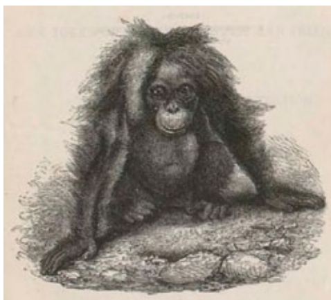
Figure 3. Frontispiece illustration in Alfred Russel Wallace, The Malay Archipelago , 2 vols. (London: Macmillan & Co., 1869), I, iv.

countenance by which it would express its approval or dislike of what was given to it” (68). The anthropomorphism becomes increasingly pronounced as Wallace describes the infant’s tantrums not as similar to but “exactly like a baby in a passion” (69). When the young orang-utan sickens and dies, Wallace describes the event as a minor bereavement, writing, “I much regretted the loss of my little pet, which I had at one time looked forward to bringing up