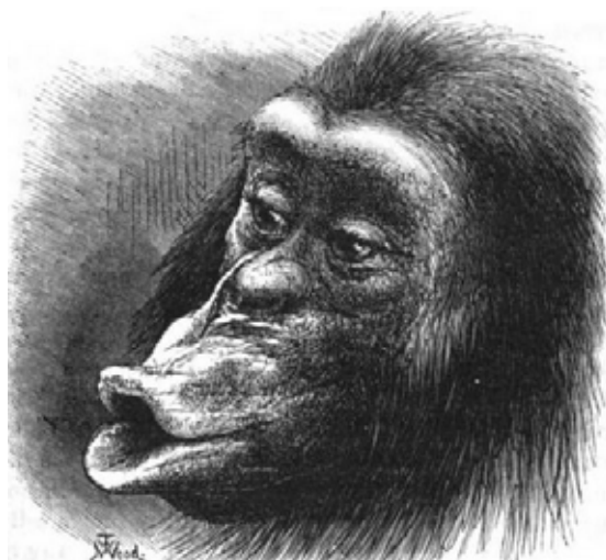
Figure 1: An engraving of a “disappointed and sulky” chimpanzee by T. W. Wood. In Charles Darwin, The Expression of the Emotions in Man and Animals (London: John Murray, 1872), 141.

The tensions within this discourse of zoological masculinity remain largely unexplored, though, particularly regarding emotions. Previous research has shown how, in Western culture, women have frequently been linked with nature and animals through their supposed emotionality (Plumwood 1993, 19–21; Lutz 2002, 104–5). The converse image of such primal, emotional femininity was the association of masculinity with detached, self-controlled rationality (Forth 2008, 30–1). Yet this model was opposed in the Victorian period by what Bradley Deane (2008) calls “primitive masculinity,” which located manliness primarily in bodily strength and instincts. Such masculinity (hinted at in Kingsley’s muscular zoologist) dovetailed with imperialist ideology by framing white men as vigorous conquerors, even as it undermined their supposed intellectual superiority over their “barbarian” antagonists. I argue that while the rationalist model characterized masculinity by restraint of emotions, the primitive one viewed certain emotions (such as the excitement of the hunt) as the essence of masculinity. As a literary scholar, I will illustrate this tension through textual close readings of travel memoirs by two of the most famous expeditionary zoologists of the period: Charles Darwin’s Journal of Researches (1845) and Alfred Russel Wallace’s The Malay Archipelago (1869).