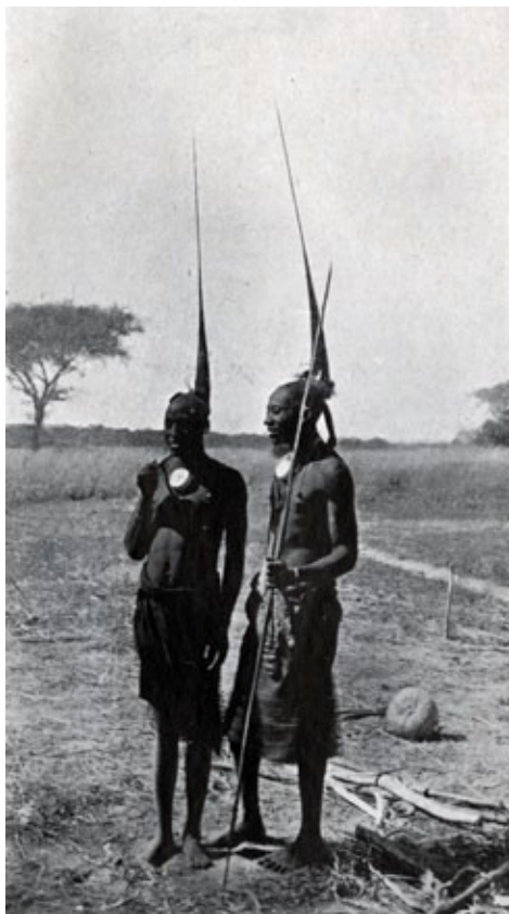
Figure 1: "Two Baila men with their long hunting cones." Photograph by William Chapman. Reprinted from William Chapman, A Pathfinder in South Central Africa: A Story of Pioneer Missionary Work and Adventure (London: W. A. Hammond, 1910).

Between the mid-eighth and mid-thirteenth centuries, men who practiced metallurgy or hunting and fishing with spears in south central Africa (fig. 1) invented and named a new category of environment: isokwe , often glossed in English as "the bush." The coproduction of isokwe , bushcraft technologies, and the fame and even political authority enjoyed by metallurgists and spearmen has often been explained by an instrumental approach to men's labors: such men produced protein and metal—both essential to the subsistence economy. Of course, protein was more readily available through growing or gathering legumes, trapping, and communal fishing. Other scholars have explained the status of technicians of the bush through a symbolic analysis of the supposedly inherent dangers of their work, or how such labors appropriated the power of women's fertility,