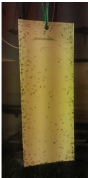
Figure 3: A fly paper covered in fungus gnats.

ber, and, much like the fungus gnats, there is no hope of getting rid of them once and for all. Wherever there is food left unattended (or uncared for), they will appear sooner or later. The red seeds in the plastic boxes almost look like sacrifices to a malicious deity that haunts the halls of the station. The intent, however, is not to appease, but to keep in check. But since we almost never see them, it is hard to tell how strongly the mice are affected by the poison traps, and whether they fall for them at all. During my three-week stay at the station, I only see two or three dead mice, but I cannot tell if they died from poisoned seeds.