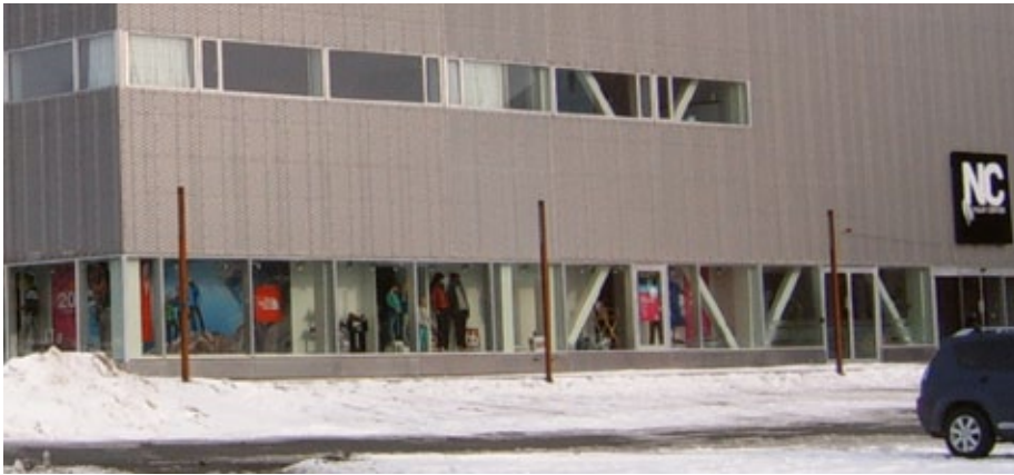
Figure 2: After the end of the monopoly trade: capitalism and abundance in Nuuk, Greenland, May 2013. The first shopping mall in Greenland is Nuuk Center. Built in 2012, it has a grocery store which sells pineapples, oranges, and whale blubber in addition to gift shops and clothing and toy stores.

supplies from a home port] as almost a necessity.” 13 That certain foods were scarce did not mean that others were not abundant, just as a landscape that lacked trees might feature volcanoes and icebergs. Arctic scarcity, unlike Arctic hunger, did not exclude an abundance of oil and whales found there. Deficiency and scarcity are conditions of dependencies; they require improvement and action on the part of central authorities. James Vernon argues in his Hunger: A Modern History that in nineteenth-century Ireland and India, “famine came to represent the inhumanity and incompetence of British rule: the British had promised free trade, prosperity, and civilization; they had delivered famine and pestilence.” 14 The Royal Danish Monopoly Trade in Greenland had promised to bring economic stability and it by and large did so, as Kjærgaard argues. The reduction of starvation and the presence of “civilization” was the reason why the company, with all of its attendant regulations on marriage, church attendance, family life, and so on, remained there and continued to exercise profound control over Inuit social and economic life until the end of its monopoly privileges in 1950 (fig. 2).