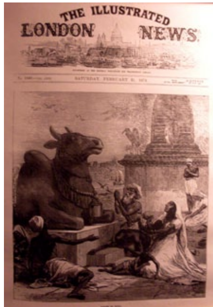
Figure 3: "Famine in India," The Illustrated London News , no. 1800, 21 February 1874.

Another engraving (fig. 3) showed a Hindu ritual in which several Indian men and women in miserable states asked for aid from deities. The deity in the illustration was named as "Bull Nandi" (the Cow's Mouth), the idol to whom people turned in seasons of drought and famine, praying for rain. The newspaper described the scene thus: