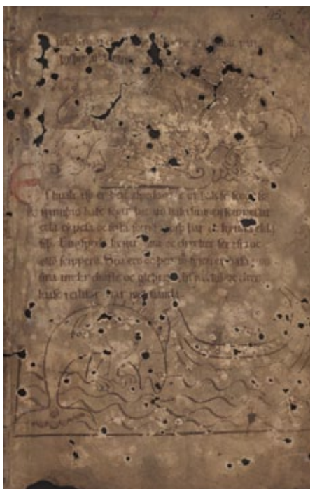
Whale illustration from a twelfth-century Icelandic translation of Physiologus.

While descriptions such as those from the Physiologus may be entertaining to read, they certainly do not tell us much about environmental conditions in the past. And this holds true for representations of nature in most medieval literature. Yet there are a few exceptions, such as a body of texts known as the Sagas of Icelanders. These texts were written in thirteenth- and fourteenth-century Iceland, but focus on the time between Iceland's first settlement and the country's Christianization, and thus the period from the middle of the ninth to the middle of the eleventh century. In doing so, they describe not only the society of the Viking age, but also the environmental conditions encountered in Iceland by the first settlers, who came mainly from Norway and the British Isles.