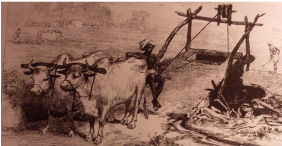
Figures 1 and 2: "The Famine in Bengal: The Indian Mode of Irrigation," The Illustrated London News , no. 1796, 24 January 1874.

project being yet completed." 4 The newspaper condemned local methods of survival and at the same time advertised the Viceroy's trip to the disaster area and the modern infrastructure built by the British. Contempt for these local Indian practices became a significant part of the political imagery of British governance and modernity.