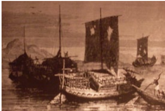
Figure 4: “The Famine in Bengal: Grain-Boats on the Ganges,” The Illustrated London News , no. 1804, 21 March 1874.

The author thought the answer to this question was the “custom” of the country that was the reason behind all evils there. However, the author saw the famine as an opportunity to “get quit of some ridiculous habit or caste usage”: “One may often hear the English Government officials, after a calamity of this kind, congratulating themselves