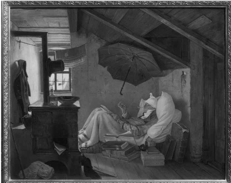
Carl Spitzweg, Der arme Poet .

True, scarcity—when referring to the artist’s precarious social position—is rarely sought but often inflicted; in other words, it is an effect rather than the explicit goal