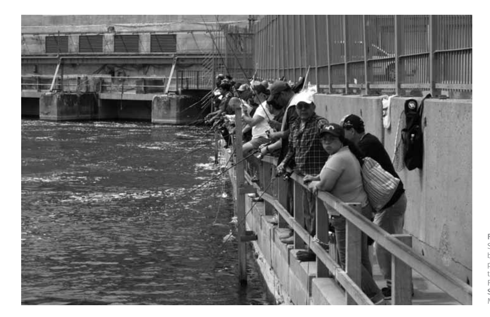
Figure 6: Shad fishermen below the hydropower plant on the Rivière-des-Prairies, 2010. Source: Michèle Dagenais

ship between them so much as it facilitated the adaptation of the latter to the former according to new aspirations, notably based on leisure considerations.