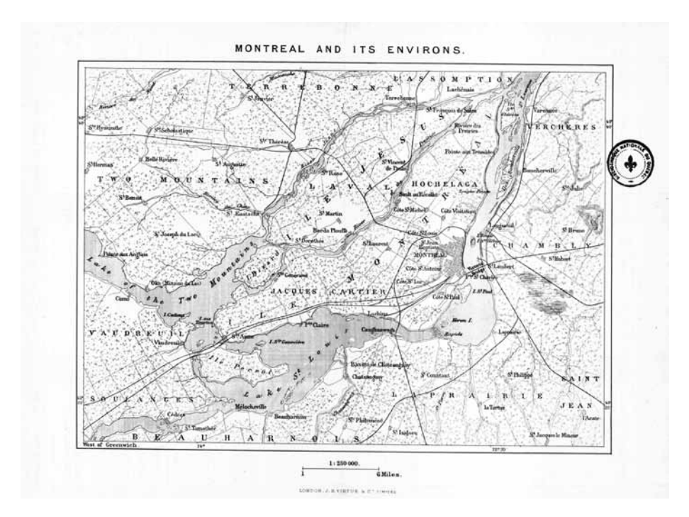
Figure 1: Montreal and its environment, circa 1900.

Mille-Îles River, which flow on either side of the island known as Île Jésus (now Laval). These rivers run for over fifty kilometers before flowing into the St. Lawrence River on the northeast end of the island. Water is also omnipresent in Montreal because it is an archipelago city, and its urban development has spread to the shores of the archipelago's rich water basin. Yet although the city's abundance of freshwater is often celebrated, Montreal has become the object of a good deal of criticism. The presence of waterways around Montreal complicates traffic in and out of the island, and is the subject of numerous complaints. In fact, crossing the rivers surrounding Montreal can be a frustrating ordeal due to frequent traffic jams on the bridges.