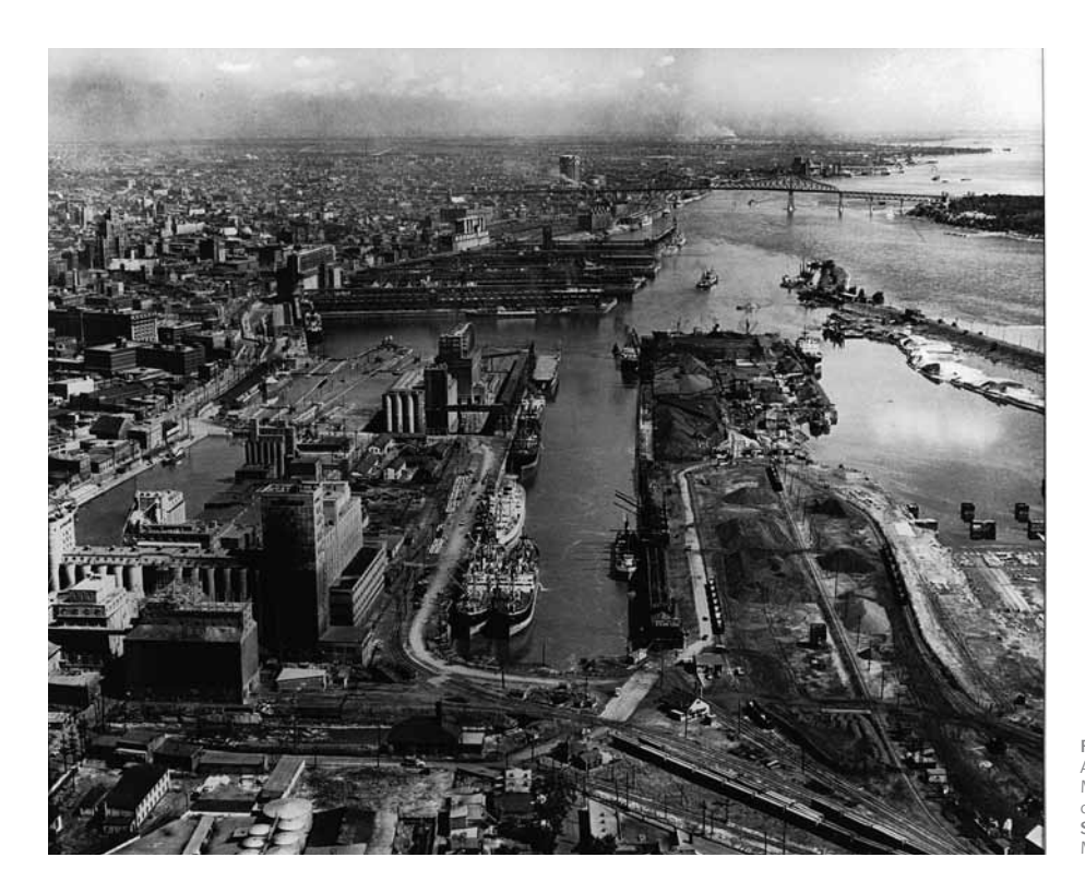
Figure 5: Aerial view of Montreal harbor, circa 1945.

mental deterioration, developed according to a new representation of waterways in the metropolitan region: they were considered sick and in need of healing in order to have new life breathed into them. The St. Lawrence was particularly targeted. This new perspective was also fuelled by a complex set of demands to protect and rehabilitate the waterways and to democratize access to the riverside environments and the water itself.