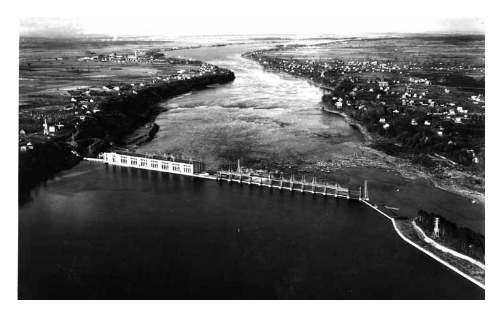
Figure 4: Hydropower plant on the Rivière-des-Prairies, n.d.

The situation was particularly critical on the north shore of the island because the Rivière des Prairies was a smaller tributary and also received wastewater from upstream. In the 1920s, the building of a hydroelectric dam transformed the riverside environment to an even greater extent. It aggravated the water pollution problem in this area. It changed the river flow, thereby preventing the increasingly abundant sewage from being discharged, so that, as a result, it accumulated along the shoreline.