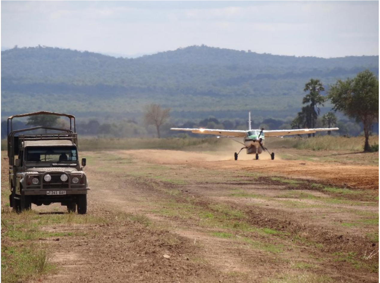
A Cessna landing alongside a Land Rover in Mikumi National Park, Tanzania. Light airplanes and the view from above still play an important role in migration research and conservation in national parks.