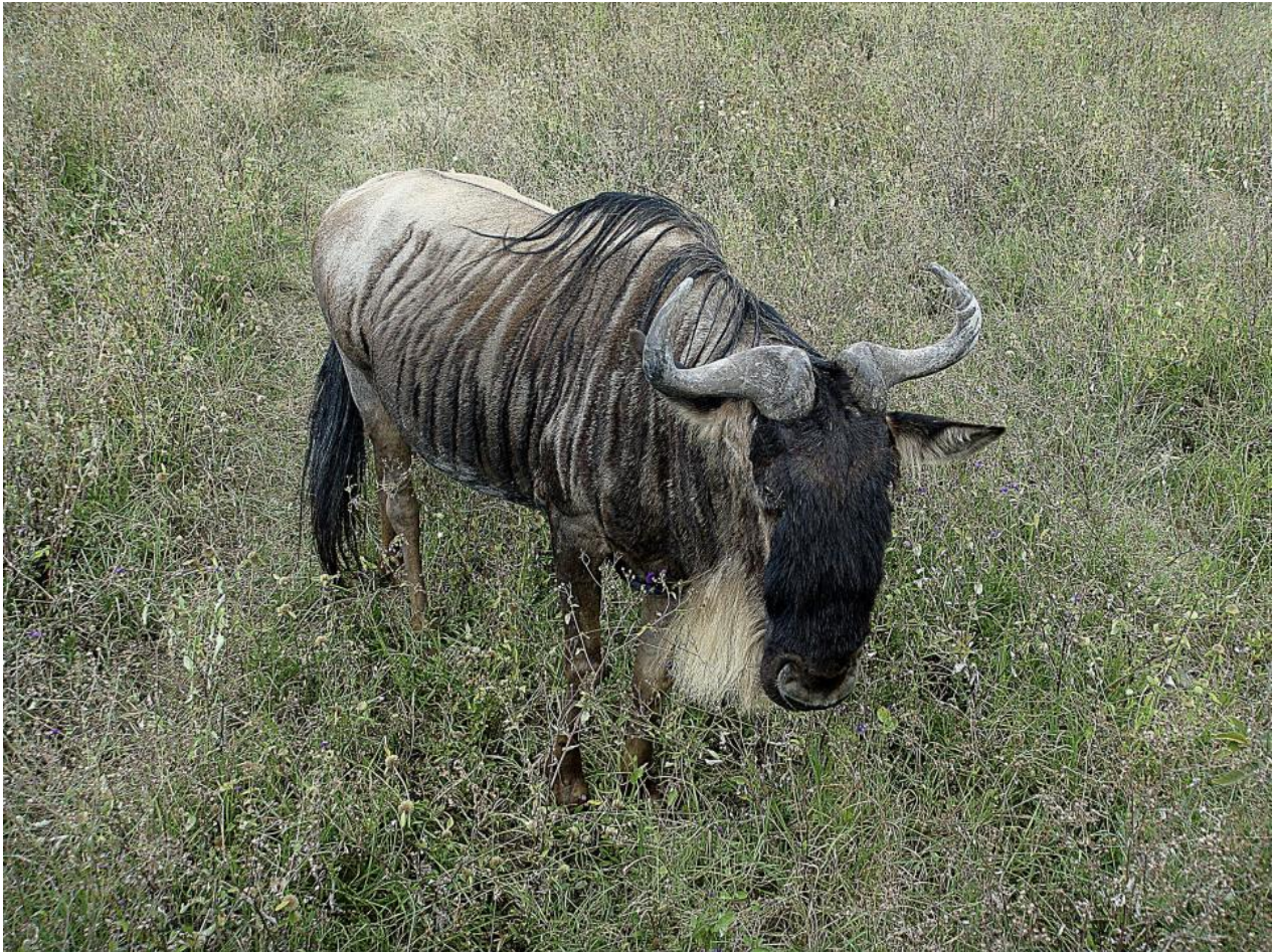
Wildebeest in the Ngorongoro Crater, Ngorongoro Conservation Area, Tanzania. The wildebeest lent itself well to aerial surveys as each animal had a distinctive light patch on its back, which facilitated the observation of individual animals.

Among the Serengeti's four seasonally migrating species, aerial observations focused predominantly on the wildebeest. The wildebeest lent itself well to aerial surveys, as each animal had a distinctive light patch on its back, which facilitated the recognition of individual animals. Wildebeest migration, in this way, not only stood in for the behavior of other ungulate species in the Serengeti, but also determined spatial management strategies for the Serengeti National Park and its surrounding areas.