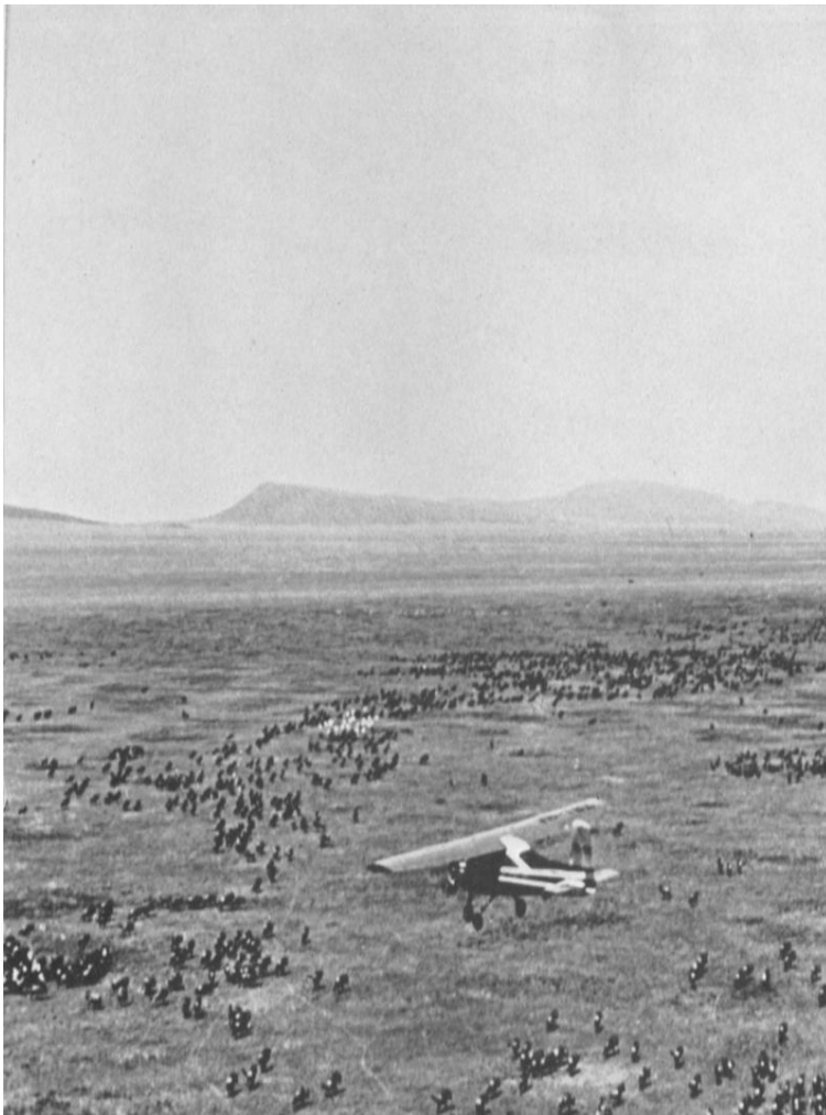
“Counting Wildebeest in the Serengeti”. Photo taken during Turner’s and Watson’s survey of Serengeti wildebeests in 1963.

150 to conduct aerial counts of sample strips, covering up to 20 percent of the surveyed terrain. Watson preferred direct counting from the airplane, as this allowed him to take into consideration wildebeest movements through different types of ground situations, for instance when migrating herds mingled with resident herds of wildebeests or with herded cattle. Only in cases of very large herds were photographs taken to facilitate the counting. Using small airplanes allowed for the detailed and continuous plotting of the routes of migrants. This movement was placed into new causal contexts, observing the environments through which wildebeests moved at different times of the year, including the types of vegetation they fed on.