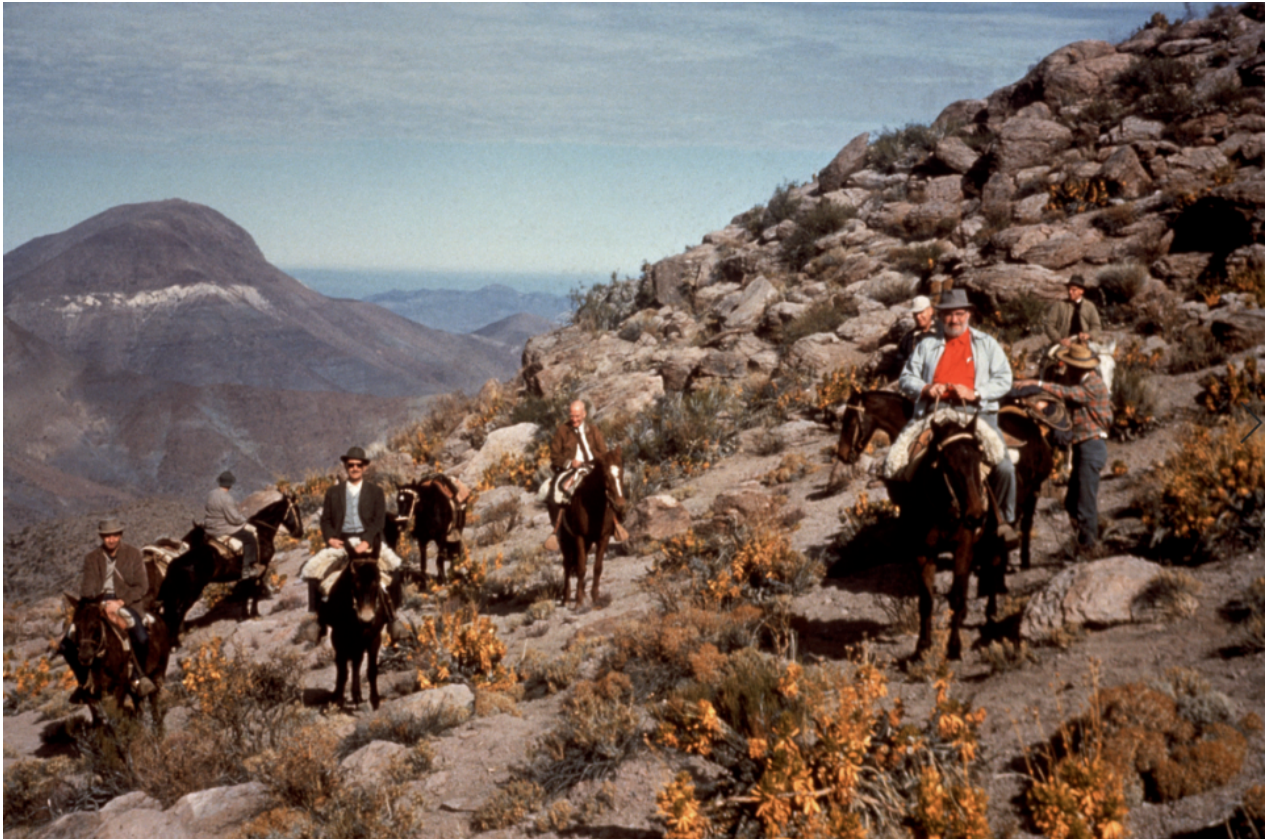
Americans and Europeans meeting on Cerro Morado, Coquimbo Region, Chile 1963.

observatories in the country. Nevertheless, Stock was the only one who developed a detailed strategy to assess several mountains in the Coquimbo region and determine which place had the best conditions for astronomical observation. For this, he had sophisticated equipment: every time he climbed a mountain, he had to bring an interferometer with him to measure the wavelength of light very accurately. Also, he had to carry a Danjon telescope to make sure visibility was of the quality they were aiming for. According to Stock's reports, interferometers caused quite some excitement among local people. It was new technology, complicated apparatus they were not familiar with.