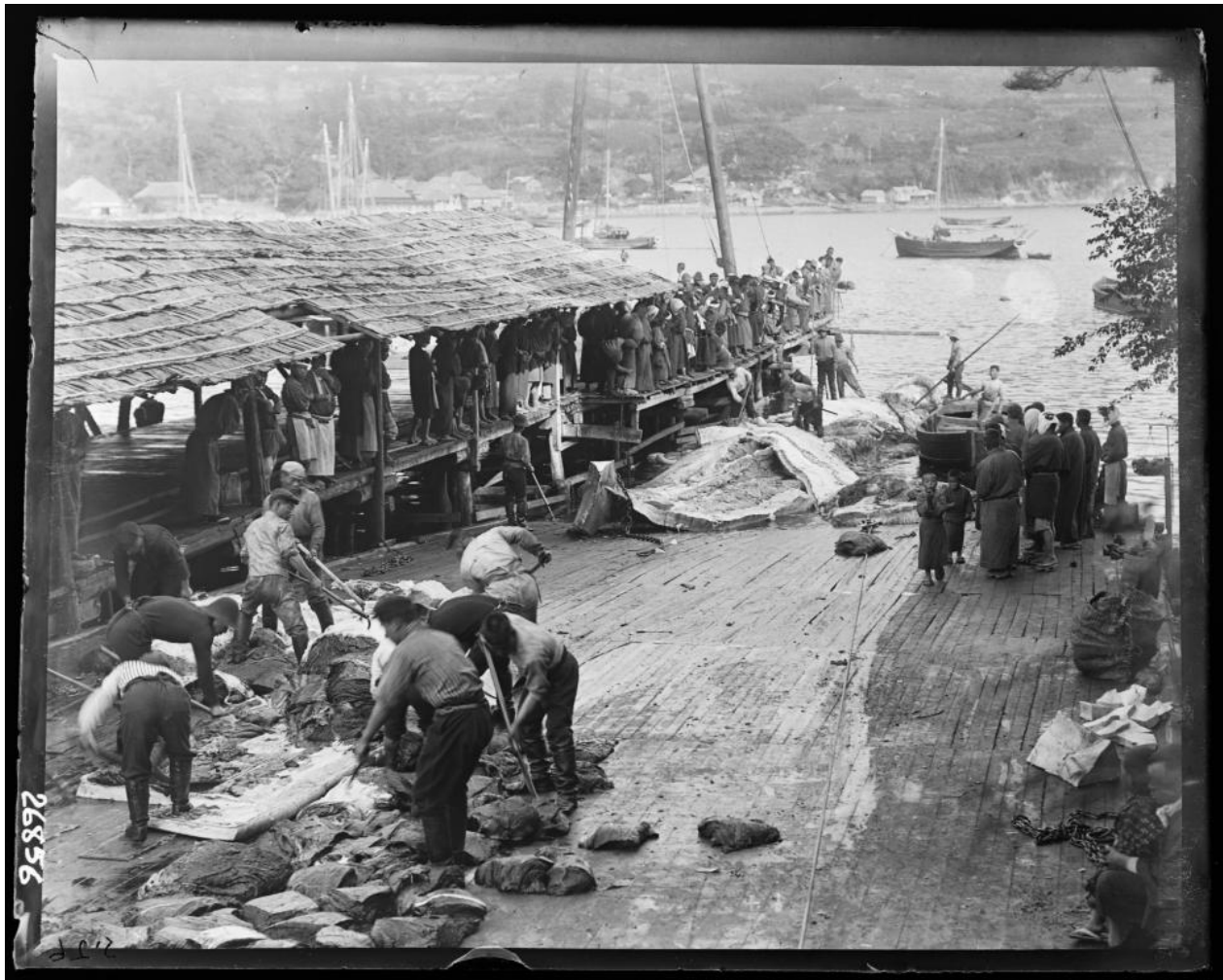
Typical scene of a whale flensing at a Japanese whaling station in 1910 (Ayukawa, Miyagi Prefecture).

would withdraw from the International Whaling Commission (IWC) and restart commercial whaling after a 31-year hiatus, the mayor of the port city Hachinohe expressed hopes that his city could become the nucleus for future Japanese whaling. He explained that “From old, Hachinohe city has had a whale culture.” Indeed, whales have played an essential role in the cultural and economic history of the region for centuries; however, Hachinohe’s relationship with whales is much more ambiguous than the words of the mayor suggest. A little more than one hundred years ago, on 1 November 1911, the largest anti-whaling riots in Japanese history struck the region, leading to the destruction of the local whaling station and the death of two rioters. As I argue in this essay, Hachinohe’s complicated relationship with whaling, while not acknowledged officially, still plays an underlying role in the city’s current push to reinvent itself as one of the leading Japanese whaling towns.