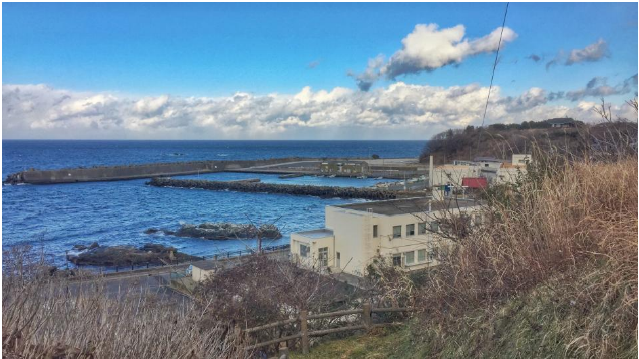
View over Ebisu Beach, where the first whaling station was built in 1911.

During the subsequent court hearing, the whaling company publicly admitted that it had conducted whaling without an official license and caused environmental and economic distress to the locals without compensating them. The company reconciled with the fishing unions and hired locals to work at the rebuilt station, becoming the largest employer in the region until the station finally closed during the Great Depression in 1933. The Hachinohe region experienced a short revival of the local whaling culture when in the 1960s, over 220 inhabitants of the nearby town of Nangō worked for the Antarctic whaling fleet. Between 2017 and 2019, whales were once again flensed in Hachinohe as part of Japan's scientific whale research program (NEWREP-NP).