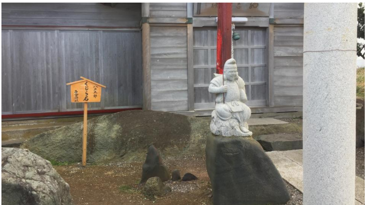
Whale Stone at the Nishinomiya Shrine near Ebisu Bay, Hachinohe. According to legend, the large stone in the background was once a whale god killed by western Japanese whalers. A statue of the god Ebisu is placed in front.

This regional non-whaling culture was challenged at the beginning of the twentieth century when whaling companies from western Japan appeared in Hachinohe. Despite the massive protests of the local fishing population, an industrial whaling station was built a few kilometers east of Hachinohe in Same-ura in 1911. The station was situated at Ebisu Beach, where, according to a popular folktale from the Edo period, a benevolent whale god, who had protected the community, had died after being mortally wounded in western Japan by traditional whalers from Taiji. The whale's body turned into stone, and a small shrine was built in his honor. That a whaling station was now built at the very same place was seen as an affront by the locals. Moreover, it soon turned out that the whalers could not dispose of all the whaling waste products, and therefore large quantities of whale oil and blood flowed into the ocean, causing widespread environmental pollution. When not only sardines disappeared from the coast, but also seaweed and sea clams, over 1,100 fishermen marched on the whaling station to burn it down. The mob then turned to the village and attacked known supporters of the whaling company.