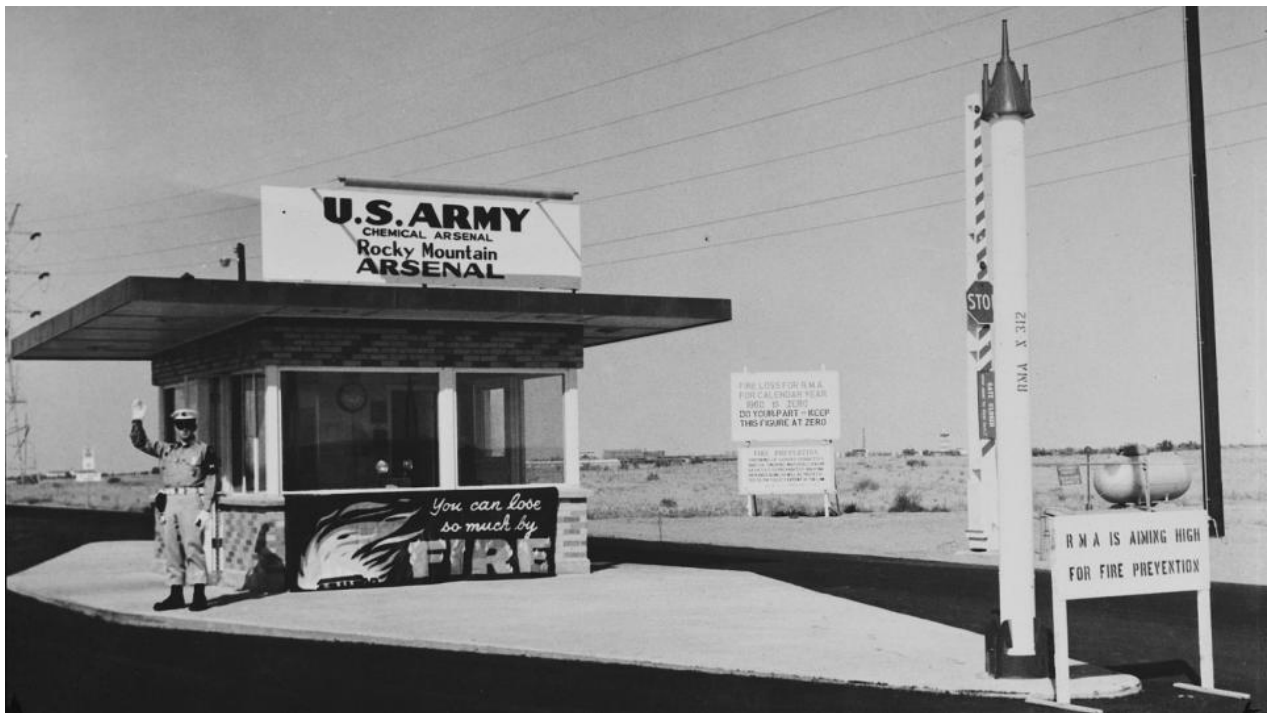
A 1960 photograph of an unnamed guard at the south entrance of the Rocky Mountain Arsenal. Signs encourage visitors to do their part to prevent wildfires.