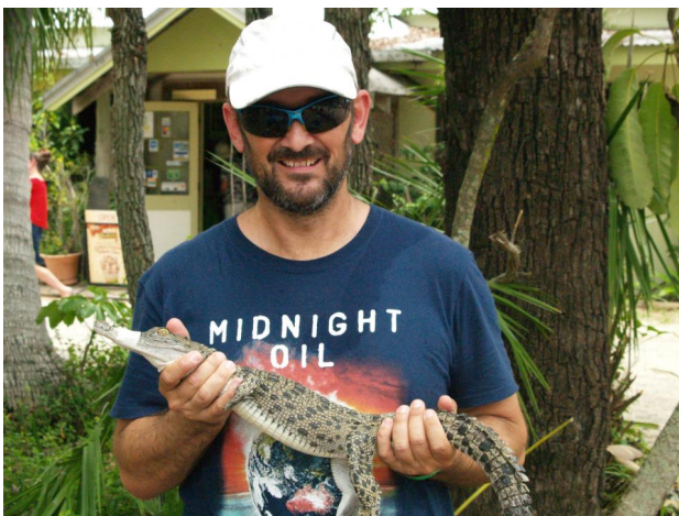
Tourist visiting Koorana Crocodile Park in tropical Queensland, 2018.