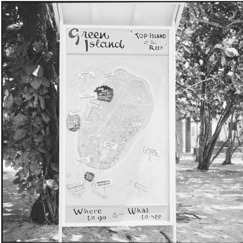
Green Island map showing locations of the underwater observatory and Marineland Melanesia, 1963.