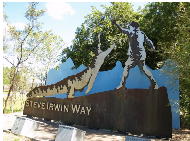
A monument featuring Steve Irwin (and crocodile) on the Sunshine Coast road named in his memory, 2019.