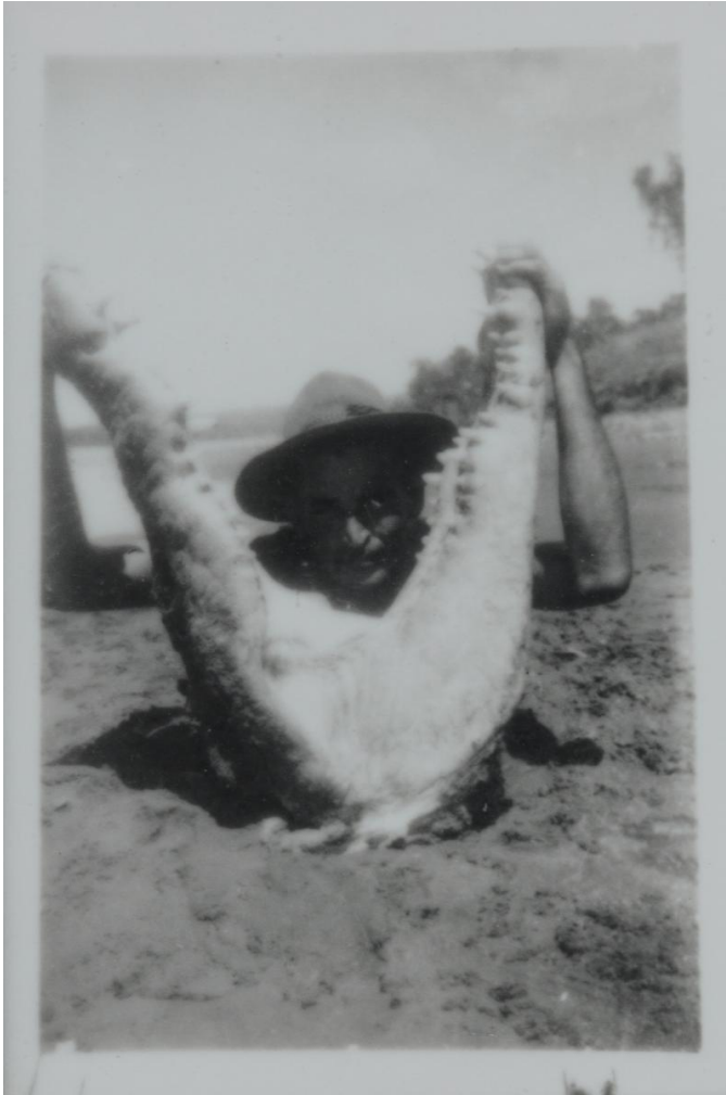
Photograph of a crocodile hunter posing with a dead crocodile at Timber Creek in the Northern Territory, 1951.