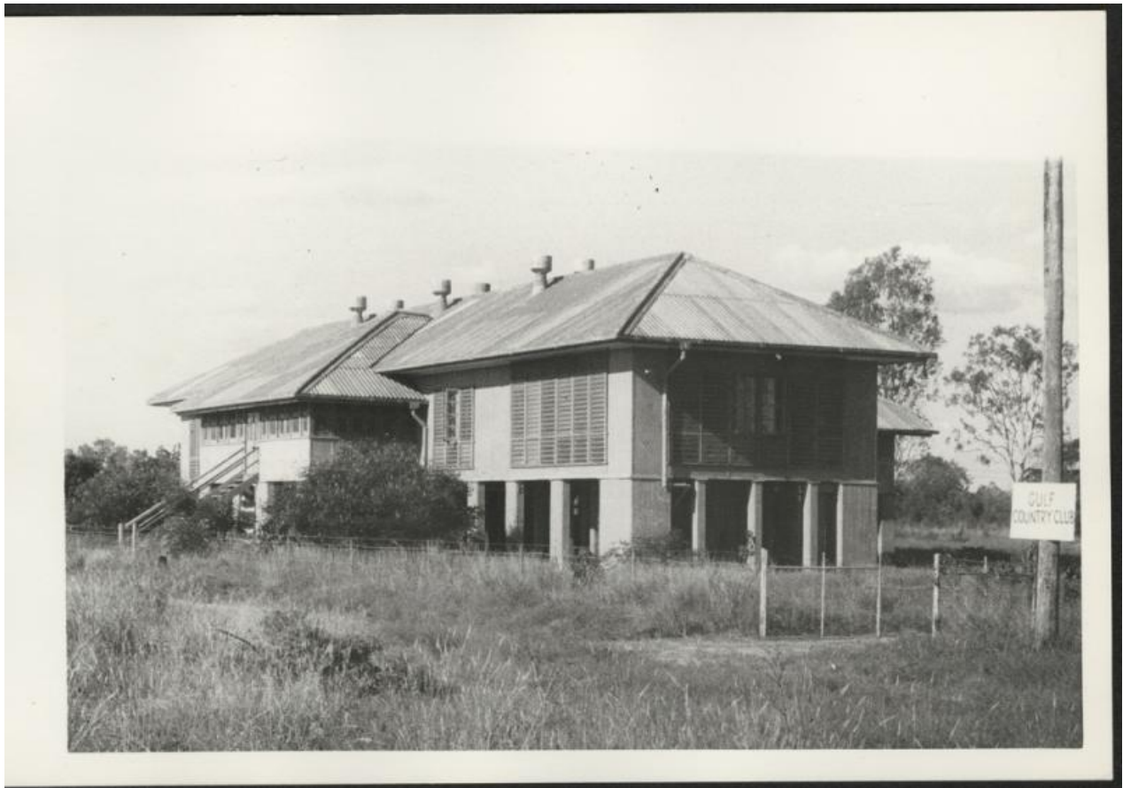
The Australian Crocodile Shooters' Club base in the Gulf of Carpentaria, 1952.

between his two main business interests to good effect. The Club, and Henri's promotion of big game hunting within Australia, clearly sought to draw southern Australians north. In skilfully arranged press coverage of Club dinners in the southern cities and of crocodile hunting trips along the northern Queensland coast, Henri promoted the possibility of reaching the north comparatively quickly and enjoying the crocodile-based adventures it had to offer. This ability to travel into remote Australia using newly available air transport and road infrastructure marked a new epoch in northern tourism, which had begun in the late 1940s and which Henri sought to develop.