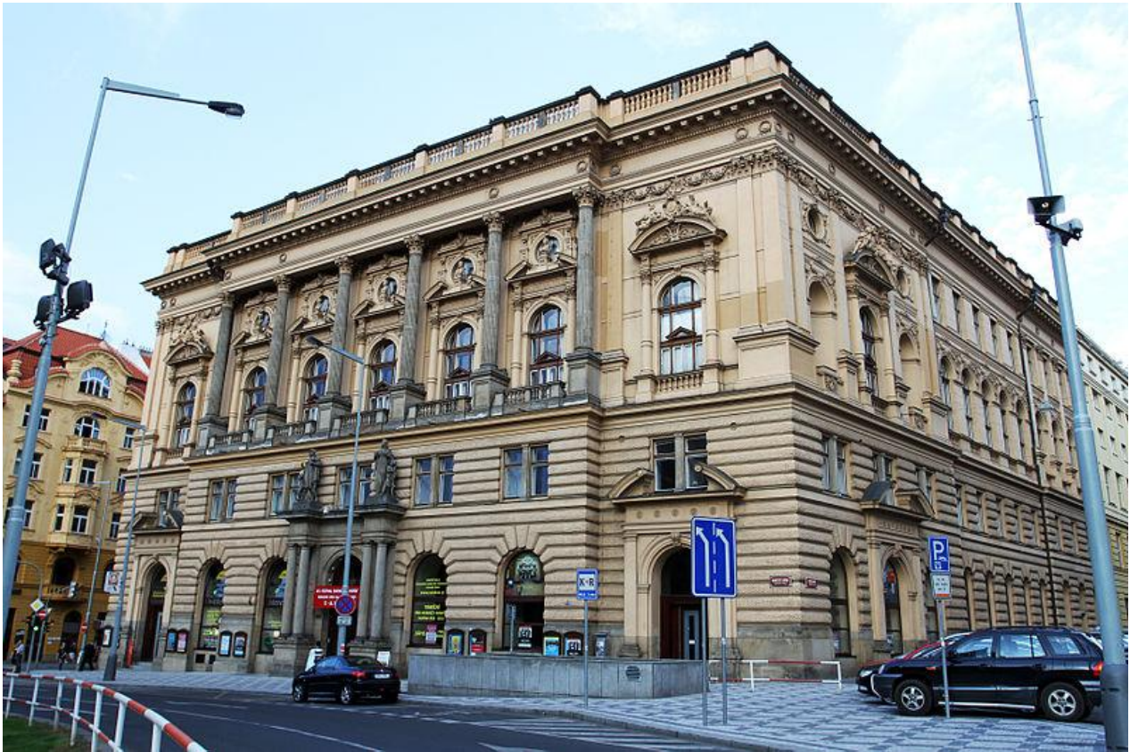
The National House (Národní dum) in Prague: venue of the Symposium on Problems Relating to Environment, May 2–10, 1971.