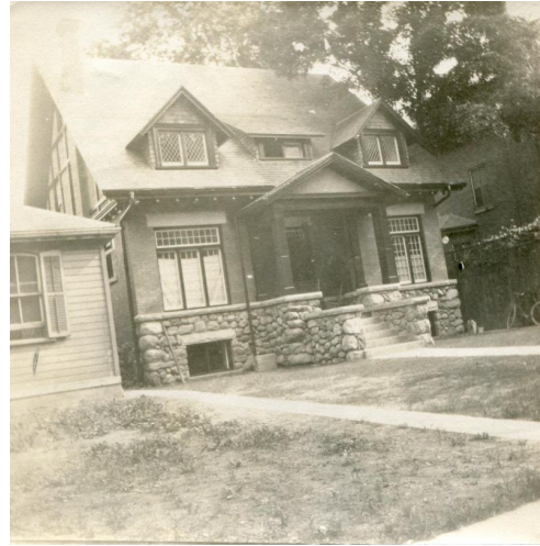
MB's house on Queens Avenue, London, Ontario (post-1949)