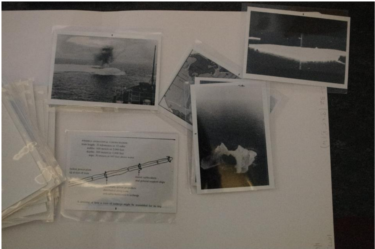
Collection of photographs shown during the Iceberg Utilization meeting.

the emergent, elemental medium of iceberg water as a legitimate form of resource provision.