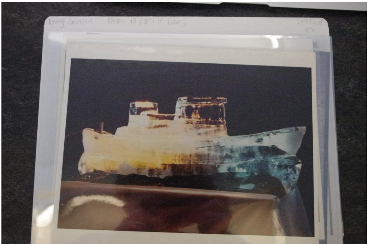
Ice sculpture of a tugboat capable of towing an Antarctic iceberg.