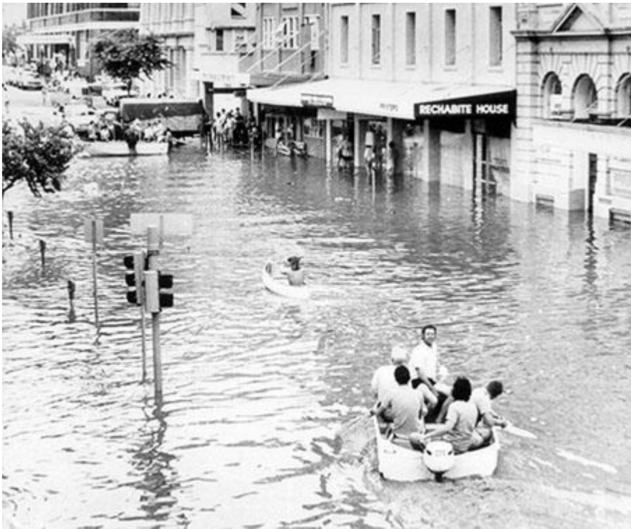
Edward Street in the city