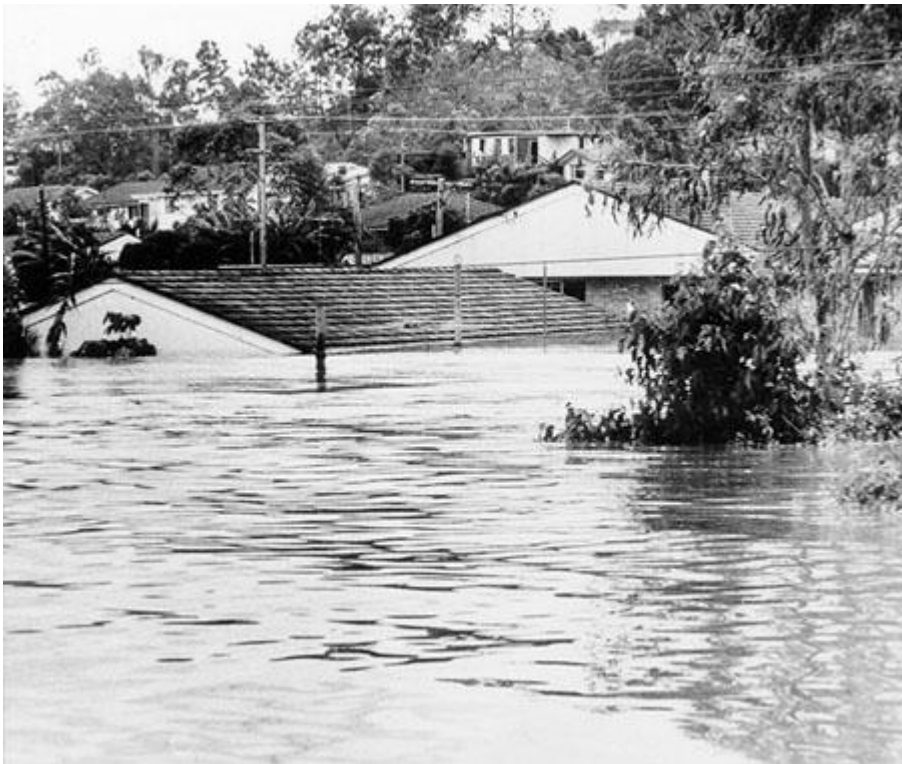
Houses submerged to roof height in the suburbs

In 1959, the Government had completed the construction of Somerset Dam, a dual-purpose structure, designed to provide water supply and mitigate floods. Much of the populace believed major floods to be a thing of the past. Consequently, urban and industrial development flourished on the floodplain in Brisbane, significantly increasing the flood hazard. As floodwaters surged towards the city, substantial damage was inevitable.