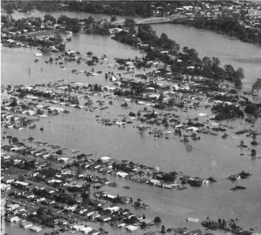
Aerial view of suburb of Chelmer where streets disappeared and houses were submerged