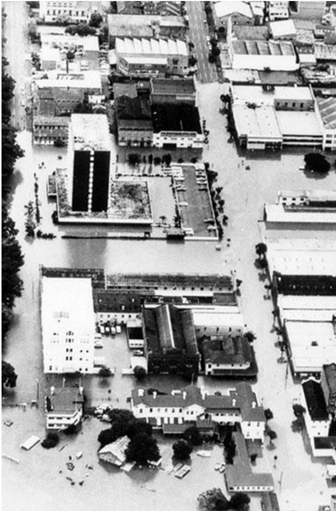
Aerial view of Alice and Margaret Streets in central Brisbane

its floodplain, submerged or destroyed all in its path. Upstream, land lay inundated to a depth of nine meters, leaving buildings submerged to roof height for up to three days.