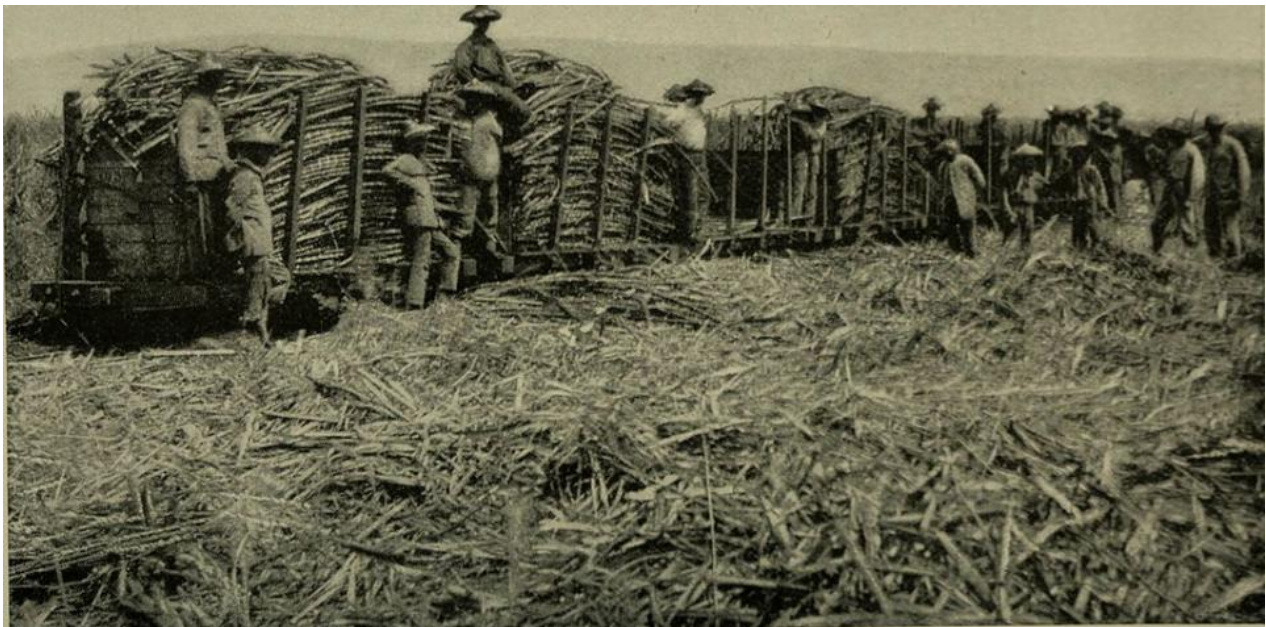
Cane fields at harvest time in the late nineteenth century. The non-white identity of many plantation workers was a cause for concern among sugarcane planters eager for annexation to the United States