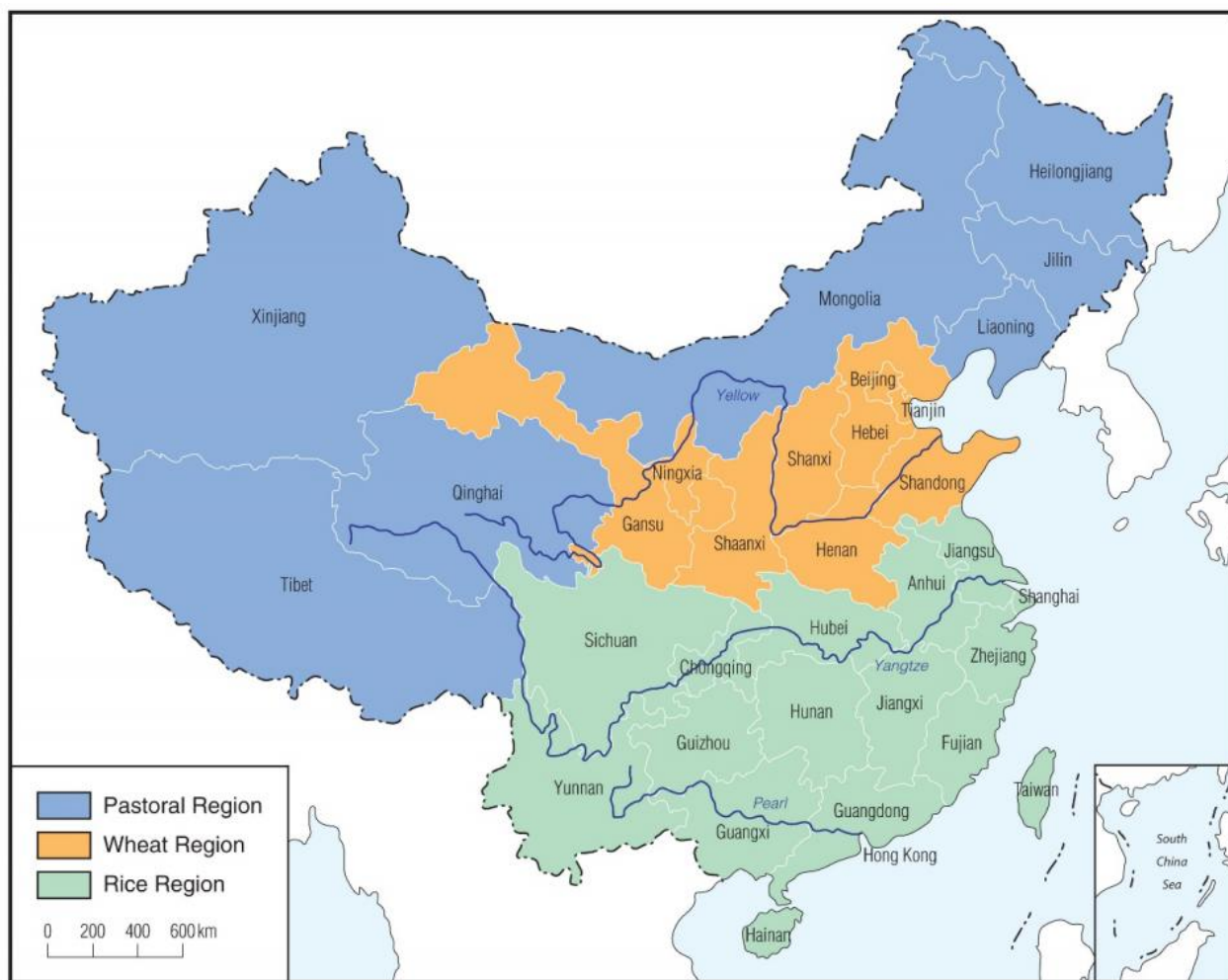
Map showing the three agro-ecological zones in China