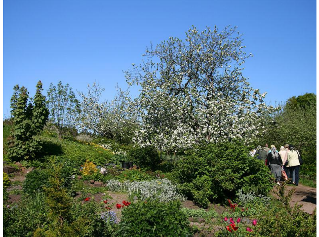
View from lower gardens 2011

Many of the new plants acclimatized successfully, due both to the island's micro-climate—gentler than that of the mainland—and to constant care and attention. Signs of respectful human interaction with nature can be seen all over the island, but this is most strikingly evident in the artificially cultivated alleys and gardens. Of the three gardens still existent today, the first was laid out in 1810: the Upper (Apothecary) Garden, 1.15 ha in area. Medicinal herbs were grown here, including rose hips, valerian, juniper, and mint.