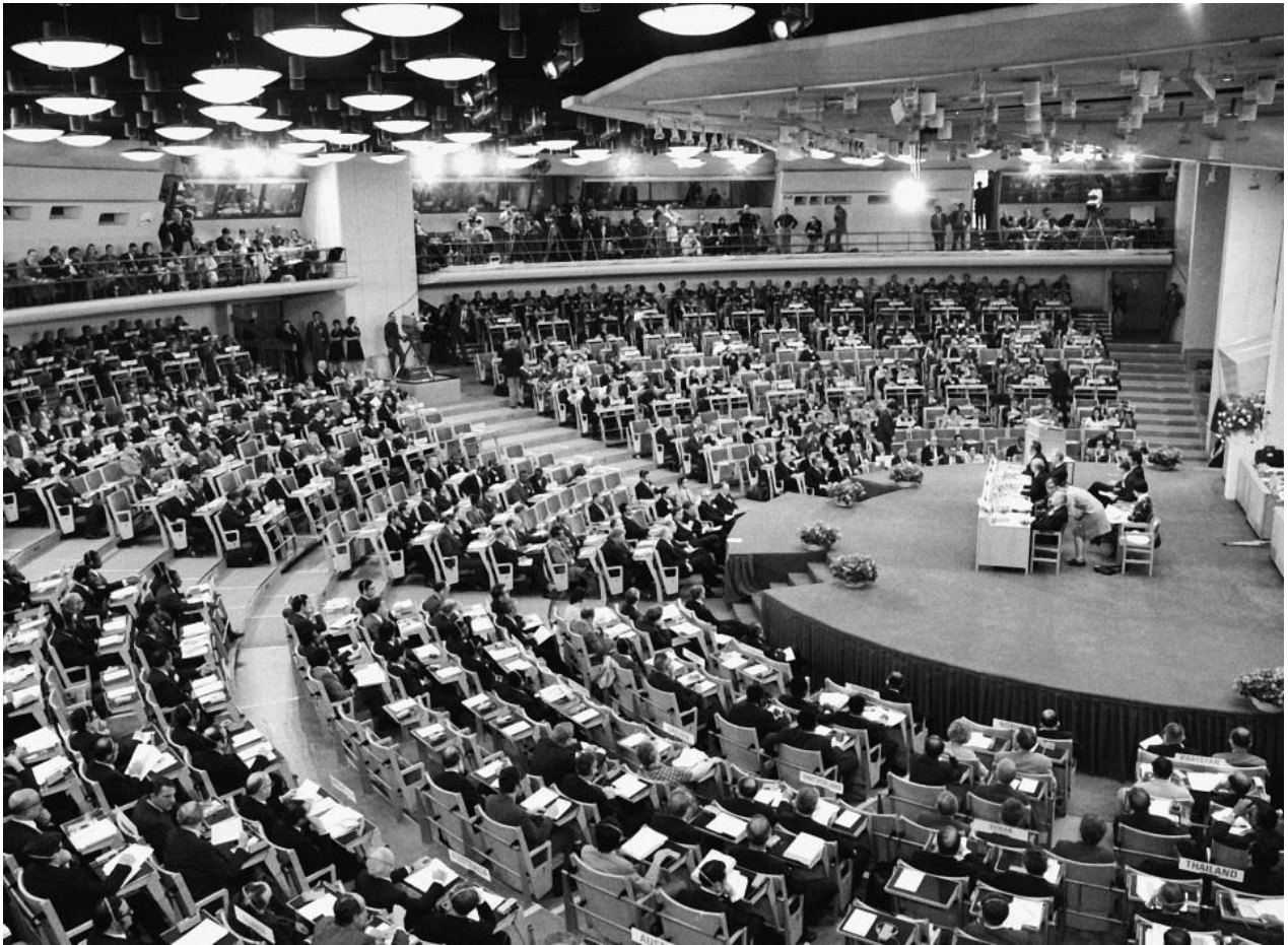
A general view of the opening meeting of the UN Conference at the Folkets Hus in Stockholm

As soon as the “Swedish matter,” as the preparation for the conference became known among UN officials, was formerly accepted, the Swedish delegation led the preparatory process to bring attention to environmental problems to the highest level of international diplomacy.