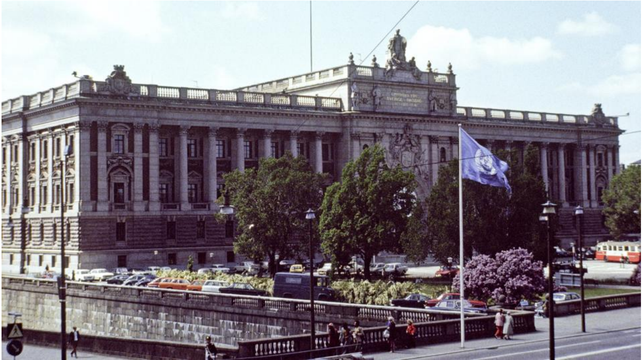
A view of the New Parliament building in Stockholm where some of the conference meetings were being held