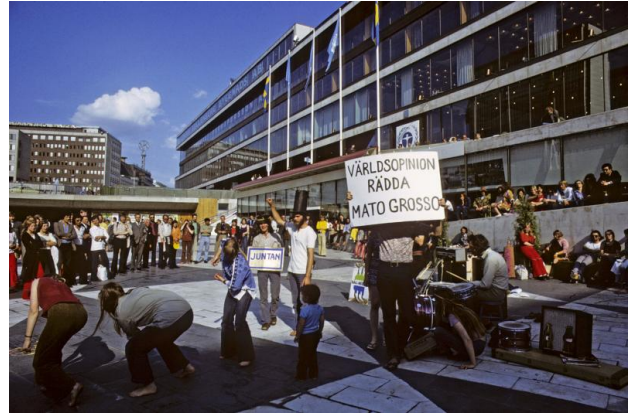
An environmentalist group demonstrates outside the New Parliament building during one of the conference sessions.

All rights reserved © 1972 UN Photo/Yutaka Nagata Click here to view UN source.